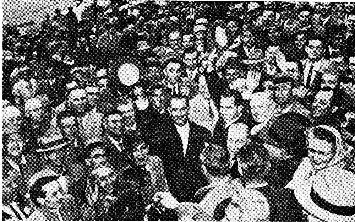
Presidents of Steel Workers locals getting a politician's handshake from Senate Democratic Leader Lyndon Johnson (left center) and Vice-President Nixon. Mass unemployment in steel industry led to holding of conference in Washington. There USWA President David McDonald said the prime demand for next contract would be the shorter work week with no reduction in pay.