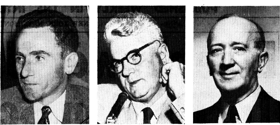
Left to right, JOHN GATES, recently resigned leader of Communist Party, who had the Daily Worker pulled out from under him and put out of existence by EUGENE DENNIS and WM. Z. FOSTER.