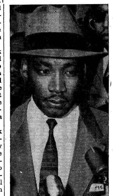
REV. MARTIN L. KING

While Negroes are sacrificing to defend their right to dignity and equality as human beings, Eisenhower makes a studied practice of refusing to recognize colored reporters at his White House press conferences (Afro-American, April 27). Yesterday terrorists engaged in another early morning shooting at the Koinonia, Georgia inter-racial farm. Today, a Texas white man who confessed killing a Negro boy 13, was freed; while an Alabama Negro convicted by an all-white jury of a "burglary" in which he stole nothing, was sentenced to death.