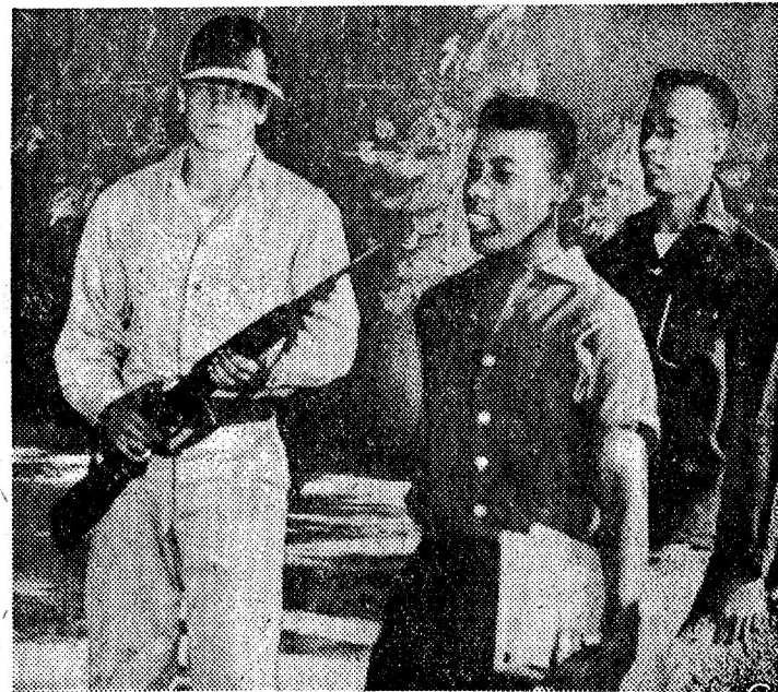
Two of eight Negro students leave school at Sturgis, Ky. under escort of National Guard. After a week-long boycott by white students, the board of education bowed to racists and barred the Negro students, Sept. 18. An opinion of the state's Attorney General paved the way for the move.

SOUTH ST. PAUL, Sept. 20 — Approximately 25,000 Swift & Co. workers struck 42 Swift packing plants across the nation today as all of the meatpacking companies refused to make any fair wage offers. Although contracts with all the