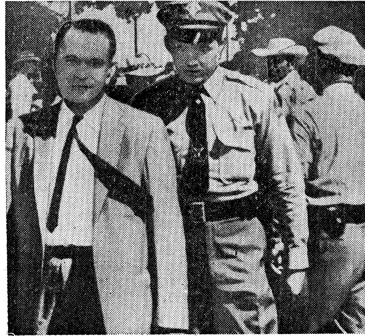
White supremacists manhandle official. Mob, aided by Texas Rangers who ordered Negro children back to Jim Crow school, prevented court-ordered integration in Mansfield. In Texarkana, the Rangers stood idly by as racists forcibly prevented two Negroes from entering Junior College.