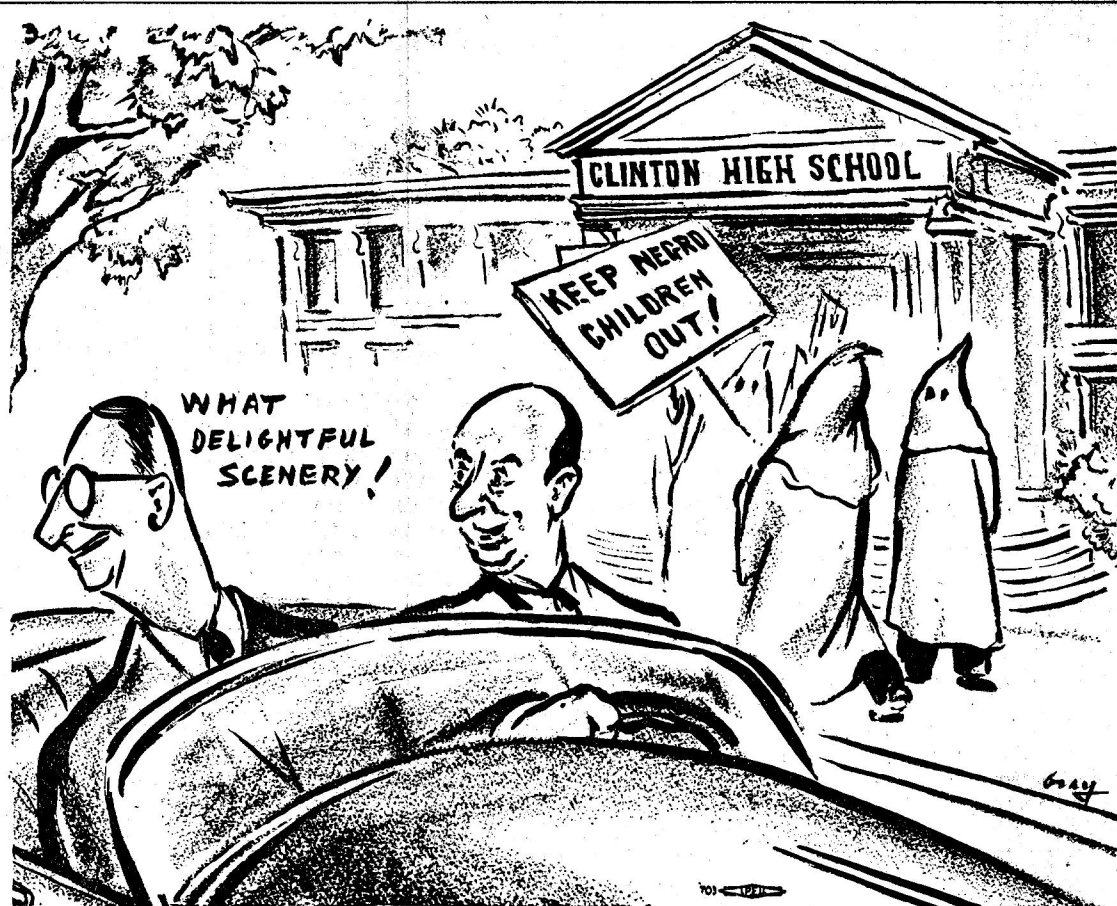
NEWS ITEM: Stevenson and Kefauver were in Clinton, Tenn., on the third day of the school rioting. Their motorcade passed within one block of the high school. Neither there, nor any where else in the South, did either Democratic candidate say anything about the riots.