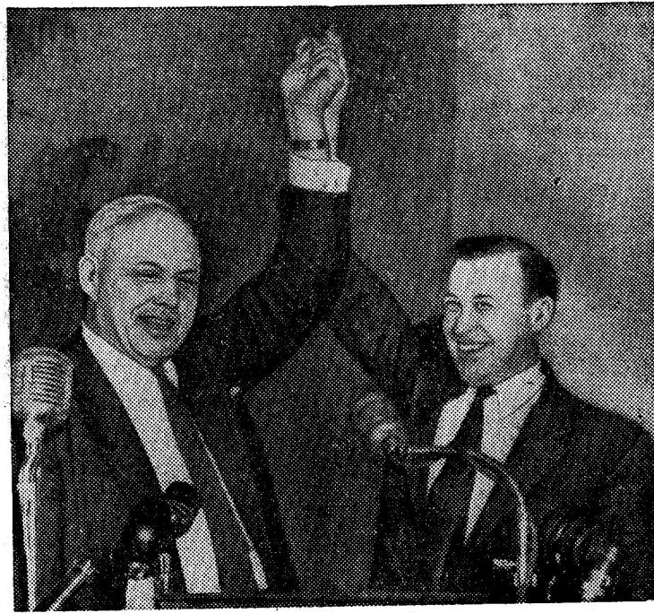
AFL-CIO Pres. George Meany and Vice Pres. Walter Reuther salute crowd of 19,000 who gathered in Bay Front Park, Miami, to protest injunctions against striking hotel workers. It was the largest labor rally in open-shop Florida and the first mass rally of the merged federation anywhere.

terial privileges to the ideology and interests of the capitalist ruling class. (See two previous articles, Militant, Feb. 13 and 20.) In a Labor Party the labor officials will carry out their class collaboration policy under new conditions.