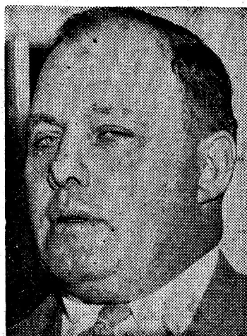
GEORGE MEANY, AFL-CIO president, has opened negotiations with the National Association of Manufacturers for a "non-aggression pact." In order to prove his respectability to Big Business last Dec. 9, Meany said, "I never went on strike in my life, never ordered anyone else to run a strike in my life, never had anything to do with a picket line. I have no experience with that type of power."

The conference concludes a two-month period of delicate