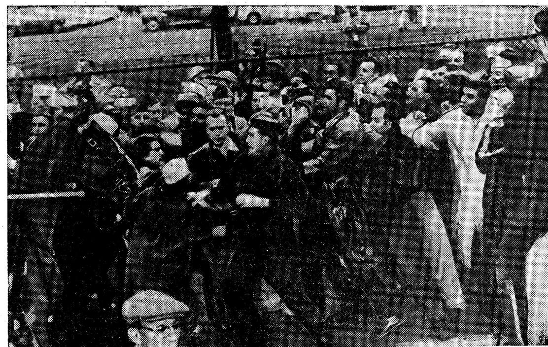
Mounted police ride into pickets at the Square D plant in Detroit. In this strike, as in the Perfect Circle strike in Indiana and now the nationwide Westinghouse strike, the bosses have used armed cops and the National Guard in their attempts to break unions. Will the "non-aggression" pact Meany proposes to sign with the NAM stop these brutal assaults?

can continue to use the South as a lever against wage increases in the North. The NAM will want a "peace pact" just for the purpose of using Meany and company to police their members and prevent the success of an organizing drive.