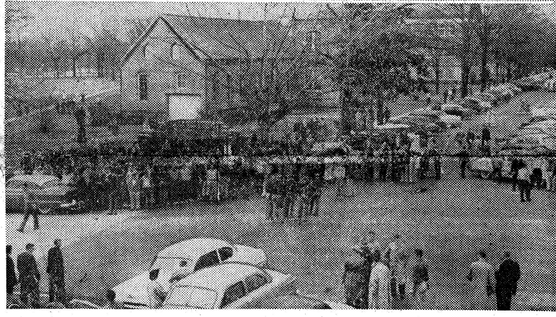
Autherine Lucy, (top, right) Negro coed admitted to Alabama University by Federal Court order, was barred by University officials from attending classes after lynch mob roamed the streets of Tuscaloosa for three days. Miss Lucy enters the car of the Dean of Women (top, left) to avoid rocks and eggs thrown by mob. Police action seen at bottom. Petitions are now being circulated by a newly organized student-faculty group asking that Miss Lucy be invited to return.