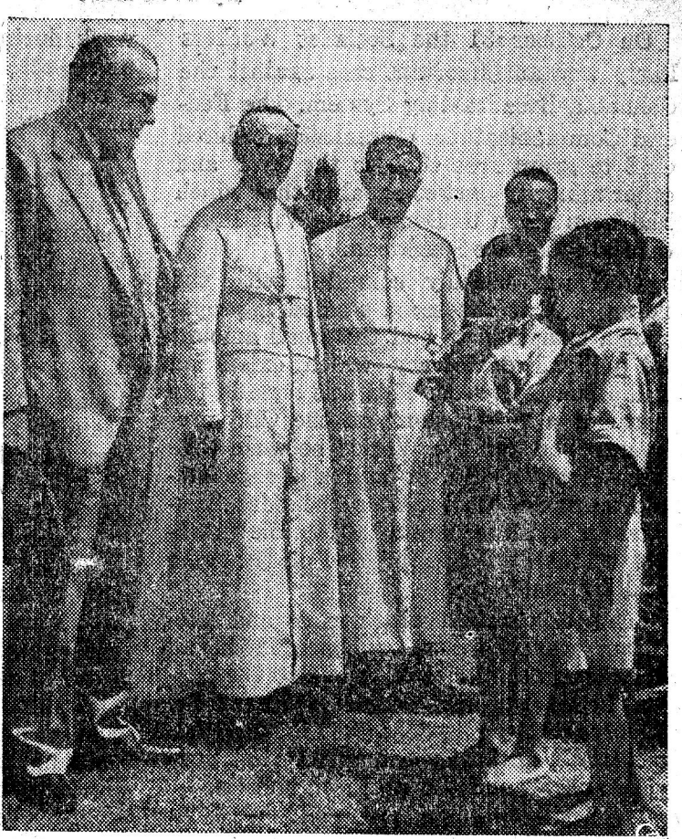
British Colonial Secretary Oliver Lyttleton poses with African children and priests during visit to Kikuyu Reserve in Kenya. Wholesale robbery of native lands by British has caused appearance of terrorist Mau Mau organization. Under pretext of combating Mau Mau, British are jailing all native opposition leaders of Kenya African Union. Floggings and mass arrests are the order of the day.

we are bound to have the reappearance of all the economic categories characteristic of capitalism: labor power as a commodity, surplus value, capital, capitalist profit, the average rate of profit, etc." This is directly counter to Stalin's claim that he has built socialism in the Soviet Union. FEAR THE YOUTH Fear of the youth haunts the bureaucracy. Stalin has suddenly discovered that the Soviet youth lacks "Marxist education," refuses to accept easily the Stalinist dogma and is "groping" — for new pathways. Here is the way Stalin put it: "The fact is that we, the leading core (read: the bureaucracy), are joined every year by thousands of new and young forces who . . . do not possess an adequate Marxist education, are unfamiliar with many truths that are well known to us, and are therefore compelled to grope in the darkness." It is in this context that one should read the appeals for "self-criticism" and warnings against the "blunting of vigilance by functionaries of the party" launched by Malenkov and others at the 19th Congress. This applies all the more to Malenkov's venomous denunciation of "people alien to us, all type of elements from the dregs of anti-Leninist groups smashed by the party" who seize every opportunity "for dragging in their line and reviving