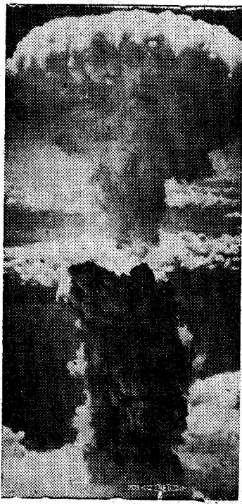
The "old-fashioned" type of atomic bomb, shown exploding in this picture, is out-classed by the new hydrogen or H-Bomb which can be made a thousand times more powerful.