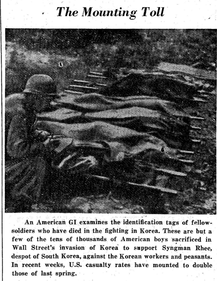
An American GI examines the identification tags of fellow-soldiers who have died in the fighting in Korea. These are but a few of the tens of thousands of American boys sacrificed in Wall Street's invasion of Korea to support Syngman Rhee, despot of South Korea, against the Korean workers and peasants. In recent weeks, U.S. casualty rates have mounted to double those of last spring.