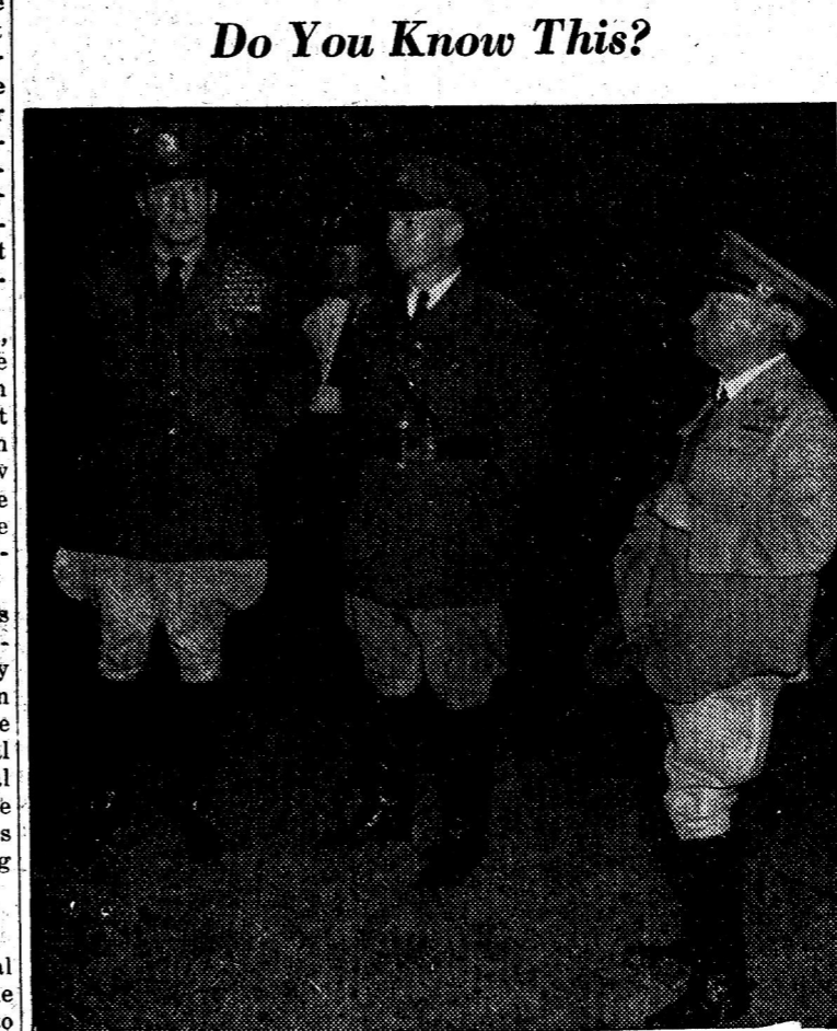
Do You Know This?

Local union officials also intervene with city officials, private relief organizations, landlords, etc., to ease the burden on the worse-off members. At the same time, they conduct a public campaign against prejudiced handling of steel cases by relief officials. Steel union officers have charged that there has been a "tightening up" by relief authorities in comparison with other recent strikes.