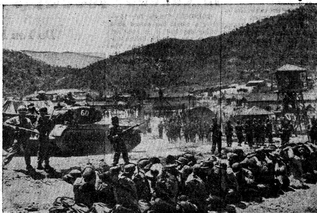
With poised rifles, U.S. troops backed by tanks stand over North Korean prisoners of war as they sit outside a prison compound on Koje Island. Last month U.S. forces killed 41 PW's and wounded hundreds of others with flame-throwers, tear-gas, grenades and bayonets when large compounds were broken up. A series of new killings and woundings has been reported.

lemical journalism in the best bourgeois tradition" and should be "widely circulated." The Worker warns that it contains "viewpoints and formulations with which no Marxist writer can agree."