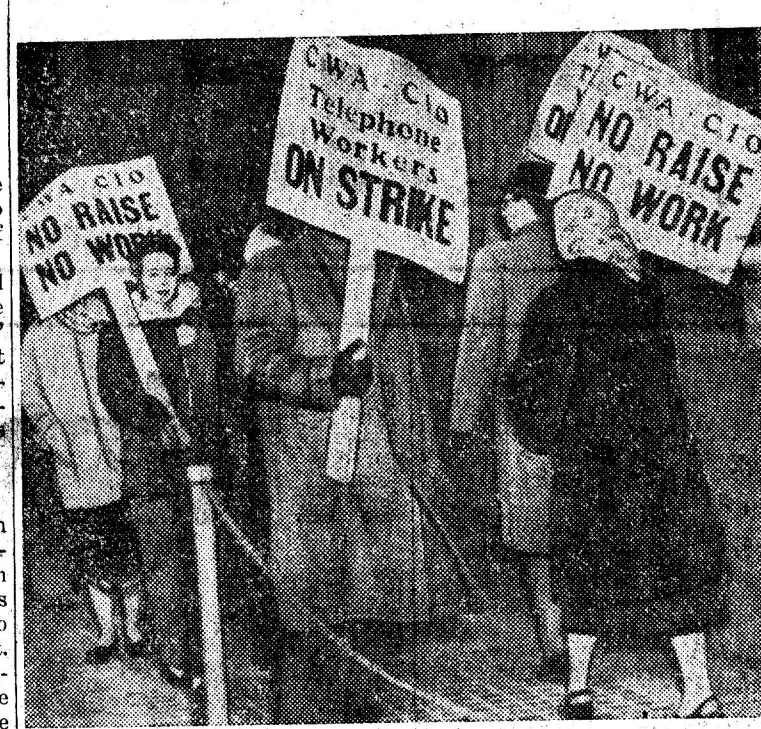
Members of District 4, CIO Communications Workers, picket main offices of Michigan Bell Telephone Co. in Detroit as part of 43-state strike of 16,000 workers. Another 300,000 phone workers respected the lines. Phone strikers in New Jersey, Ohio and Michigan have won wage increases ranging from 11.3 to 12.7 cents an hour.

The workers, installation and warehouse men, are on strike against the Bell System's manufacturing subsidiary, the Western Electric Company. They are demanding pay raises of 23c per hour.