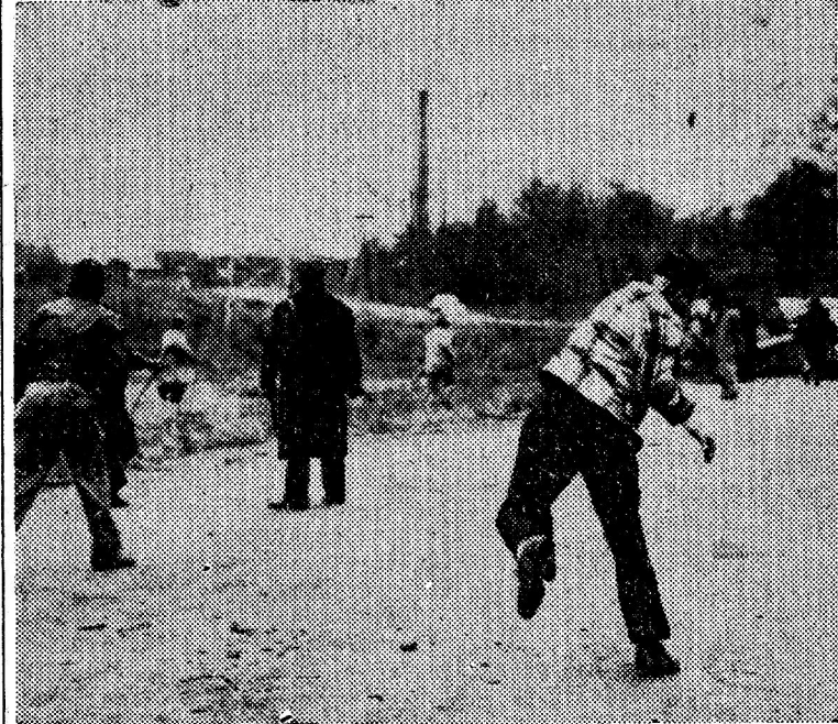
Pickets rout strikebreakers who tried to move 200 tons of finished goods from strikebound plant of Whippany Paper Co. in N. J. In all-day battle with scabs, 12 persons were hurt, most of them members of the CIO United Paperworkers.

DETROIT — Despite the fact that the CIO United Auto Workers constitution provides that a new election must be held within 60 days after an administratorship is placed over a local union, President Reuther of the auto union intends to deny such an election to Ford Local 600, which was placed under an administratorship on March 15.