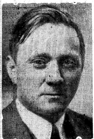
WILLIAM O. DOUGLAS

But the hundreds of millions of poor peasants all over Asia, the Middle East and North Africa have not waited for Douglas' "American revolution of social justice." They have not asked by-your-leave of Washington, nor relied on the polite, gentle and