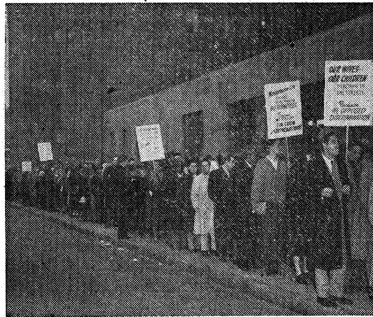
The pickets shown above at Stuyvesant Town in New York City forced the Metropolitan Life Insurance Co. to back down on its Jim Crow policy. These landlords agreed to cancel evictions of 19 families who opposed ban against Negro tenants.