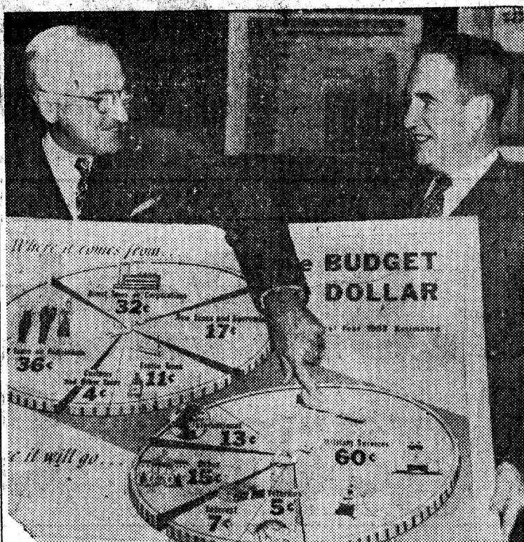
Truman, in company of Dir. Lawton of Bureau of the Budget, proudly displays chart in Washington showing 60c of tax dollar earmarked for arms program here, plus another 13c for arms abroad. Actual arms costs, for wars past and present, are over 85c.