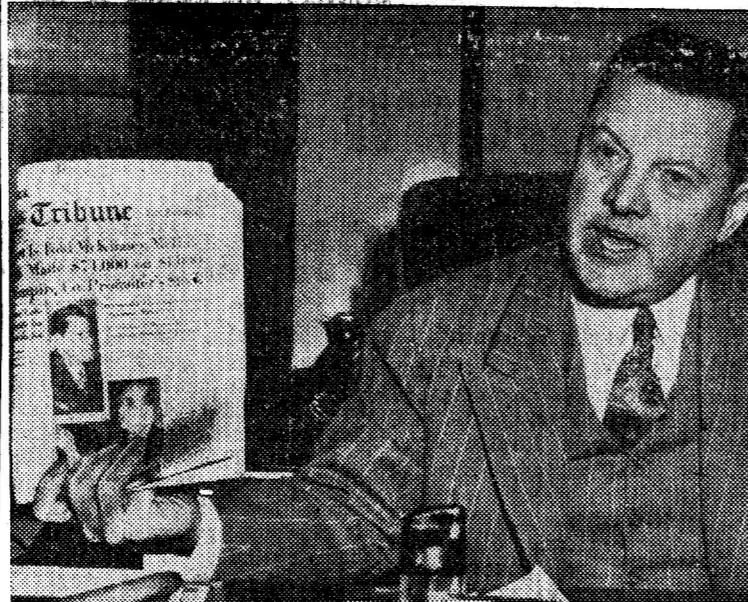
At Washington press conference, Democratic party chairman Frank E. McKinney holds up copy of story that revealed how he made $68,000 profit on $1,000 investment in Empire Tractor Co., which later went bankrupt. McKinney admitted making the profit but said it was "all ethical and honest."