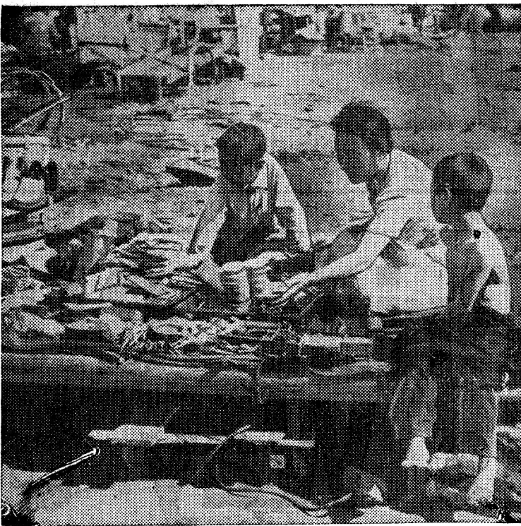
Truman's "police action" has deprived thousands of homeless and abandoned children in Korea of any means of livelihood except through black market operations. Shown above, near Seoul's east gate, is a woman aided by two little boys, selling stolen goods.