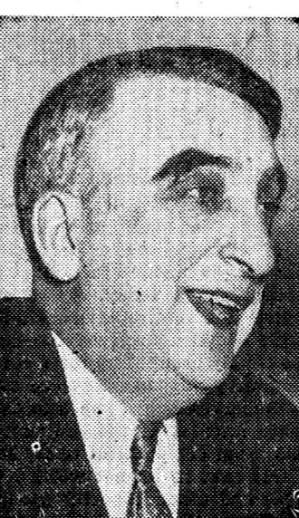
U. S. Supreme Court Chief Justice Vinson who wrote the majority opinion which up-held the Smith "Gag" Act and legalizes thought-control in the United States.

section of the Smith Act used to convict the Trotskyists, the Worker published a lengthy "letter" to liberals trying to show that the two cases are "not parallel" and to "equate" them would "damage" the case of the 11 Stalinists. It was OK to jail the Trotskyists because, it lied, they were "charged" with "overt acts" and "sedition." Of course, the 18 Trotskyists were convicted of "advocating and teaching" the ideas of Marxism and Leninism.