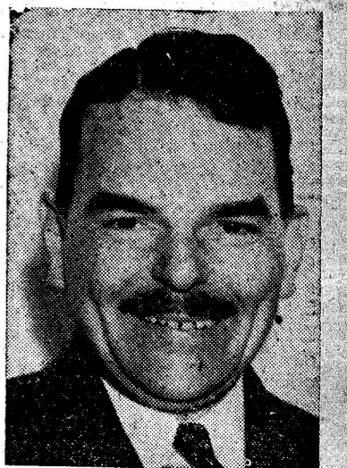
THOMAS E. DEWEY