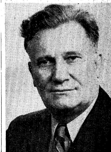
JAMES P. CANNON

Farrell Dobbs, the presidential candidate of the Socialist Work-