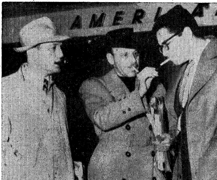
About to fly to Washington where they pleaded not guilty to contempt charges are (l. to r.) Edward Dmytryk, director of the movie Crossfire , and film writers Alvah Bessie and Ring Lardner, Jr. Lardner and Dmytryk have filed multi-million dollar breach of contract suits against their companies for having been fired because they defied the House Un-American Activities Committee.