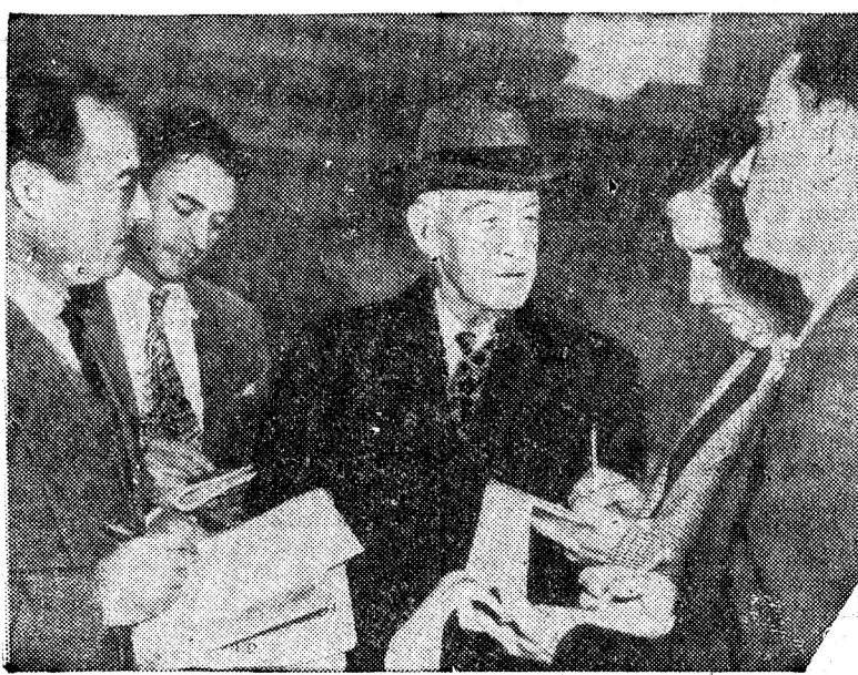
Frank T. Hines, U. S. Ambassador to Panama (center) meets with President Truman. After the Panama Government refused to renew leases for the bases, the U. S. announced it was evacuating its forces.

Europe—the basis of all prosperity—was not even attempted. This would involve the reconstruction of all the means of production in Europe to permit a considerable increase in exports. Only thus could the equilibrium of trade balances of the nations be assured.