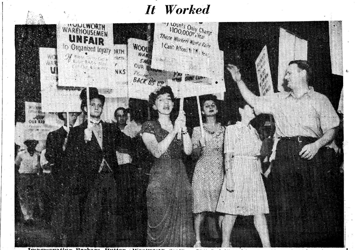
Impersonating Barbara Hutton, Woolworth waitress, and a couple of her cohorts, members of Local 65, CIO Wholesale & Warehouse Workers, "picked" their union's picketline with signs reading: "My Counts Only Get $100,000 A Year, I Can't Afford A Raise For These Workers." The demonstration took place after the company had refused to offer any wage boosts and demanded abolition of the closed shop. Right after the protest, Woolworth offered a $2 weekly wage increase.