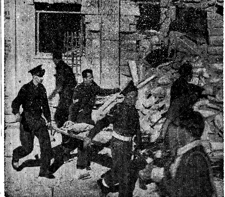
British martial law in Palestine has been answered by a new outbreak of bombings, resulting in scenes like the one above. The British are turning over the Palestine question to the United Nations and the Zionist organizations are continuing their pressure to increase immigration.