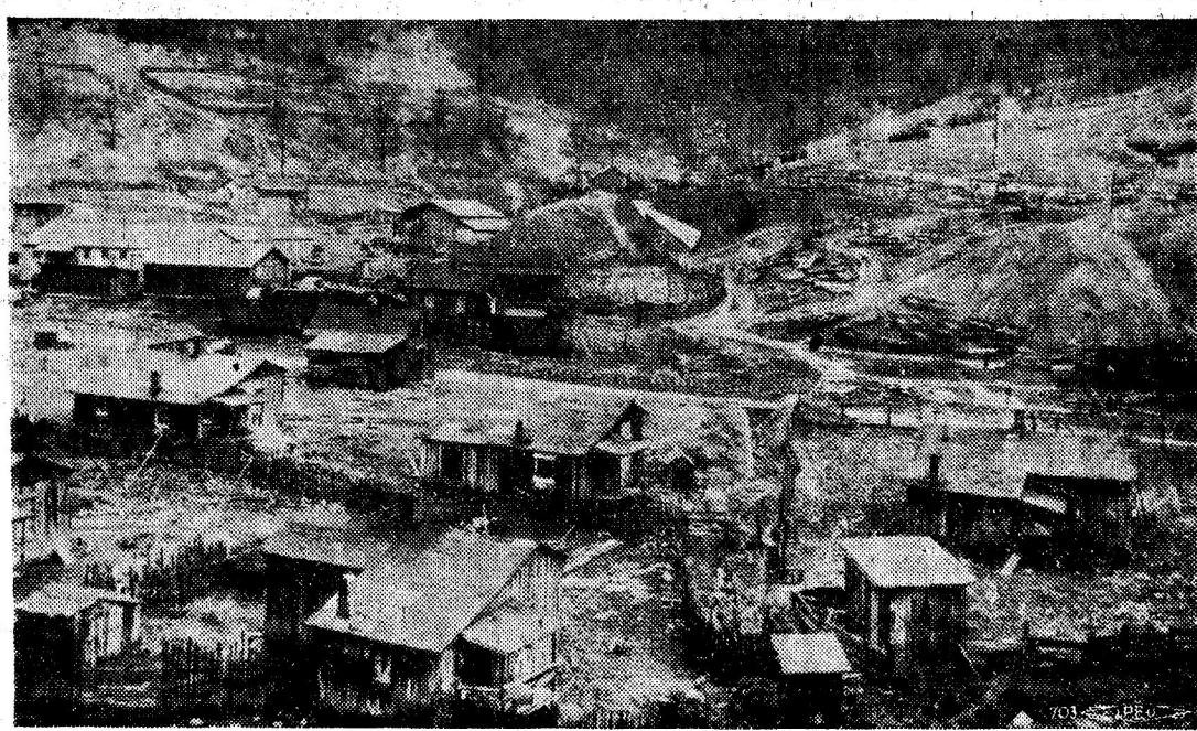
More miners' lives were sacrificed last week to the greed of mine owners who callously disregard essential safety measures. An underground explosion trapped 31 men in the Straight Creek Coal Company's No. 1 mine in Pineville, Kentucky. This is a general view of the village and the shacks in which the miners are forced to live. Relatives and friends of the entombed men are gathered at the entrance of the mine (arrow). (Story on page one.)