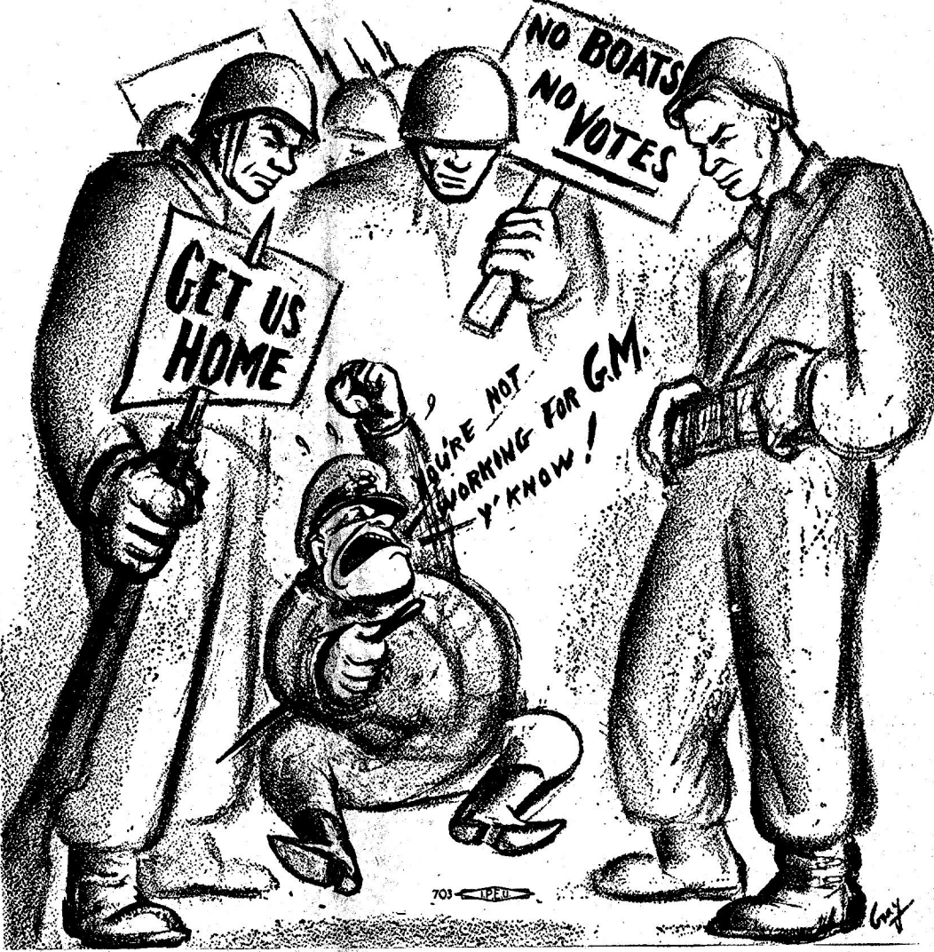
News Item: Col. J. C. Campbell in Manila tells 4,000 troops demonstrating to go home: "You men forget you're not working for General Motors."