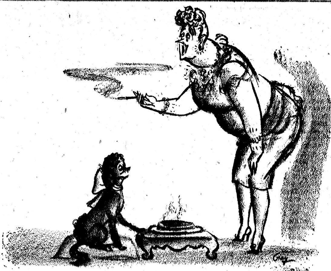
"Shame on you, Fifi—not to finish your steak when so many people are hungry!"

The full fighting strength of the mighty UAW must be brought into united action to ensure victory against the combined forces of auto monopoly. That is the only effective answer to the collusion of the "Big Three."