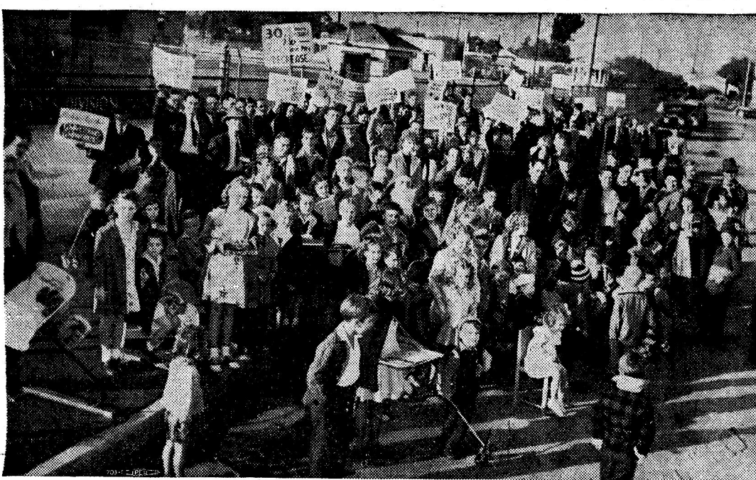
You can be sure that General Motor's wasn't the Santa Claus at this party of UAW strikers' children. Held right on the picket line in front of GM's South Gate, California plant, this party was a huge success, with all the youngsters receiving Christmas presents contributed by UAW Local 216 strikers and sympathizers.