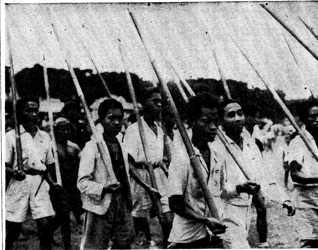
Some of the bravest fighters against British and Dutch oppression are the Indonesian youth. They are shown here, armed only with primitive spears, as they march at an independence demonstration in Jogjakarta, Java. It is such heroic fighters as these that the imperialist troops are trying to suppress.

cisive blows against the bourgeois class and its state. It is not enough to observe that bourgeois politics are rotten. They must be fought by honest revolutionary working class politics.