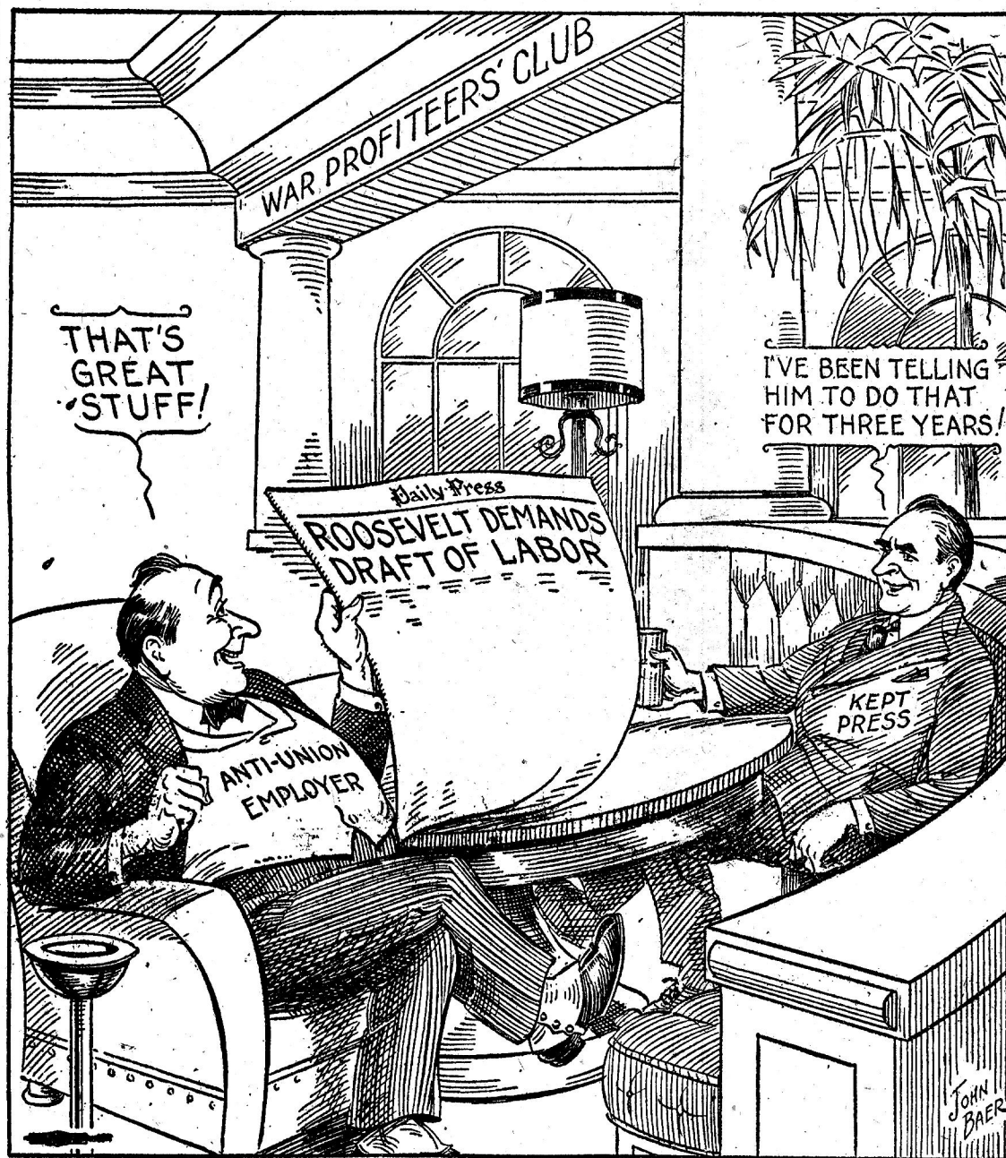
Reprinted from "LABOR"