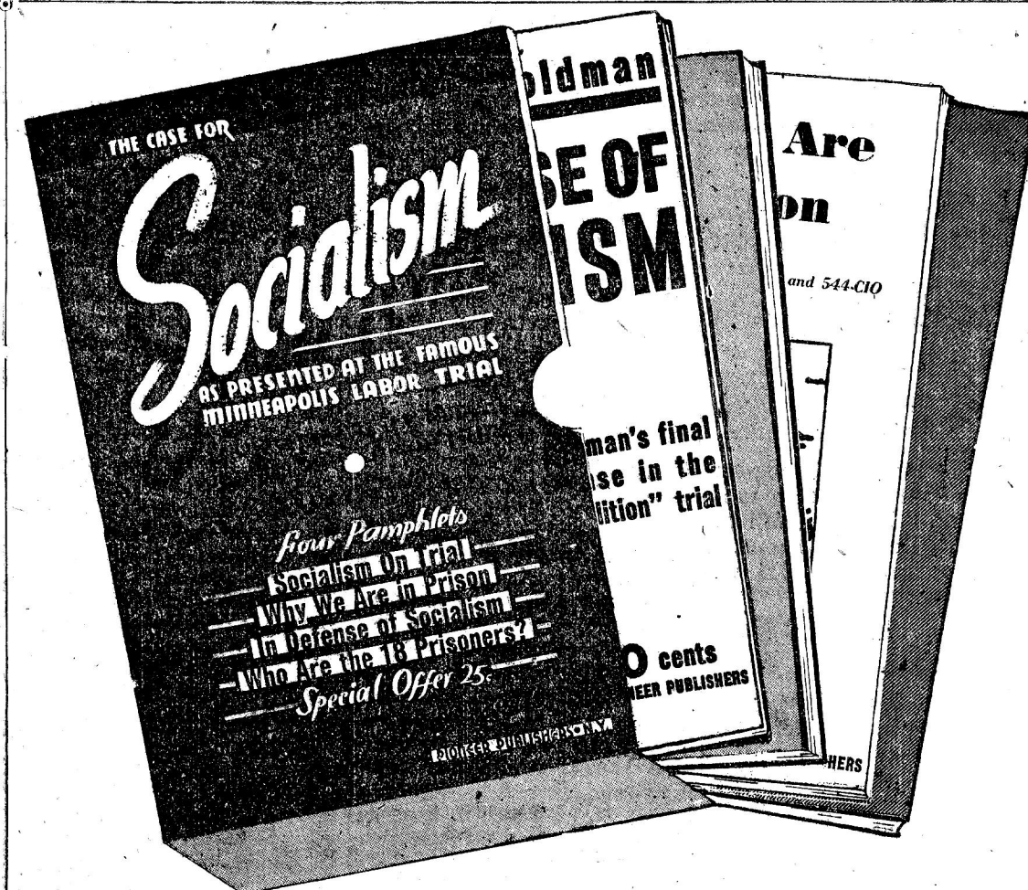
The four pamphlets above, packed in an attractive container, are being offered to new readers of THE MILITANT for only 25 cents, by Pioneer Publishers. The regular price is 40c.