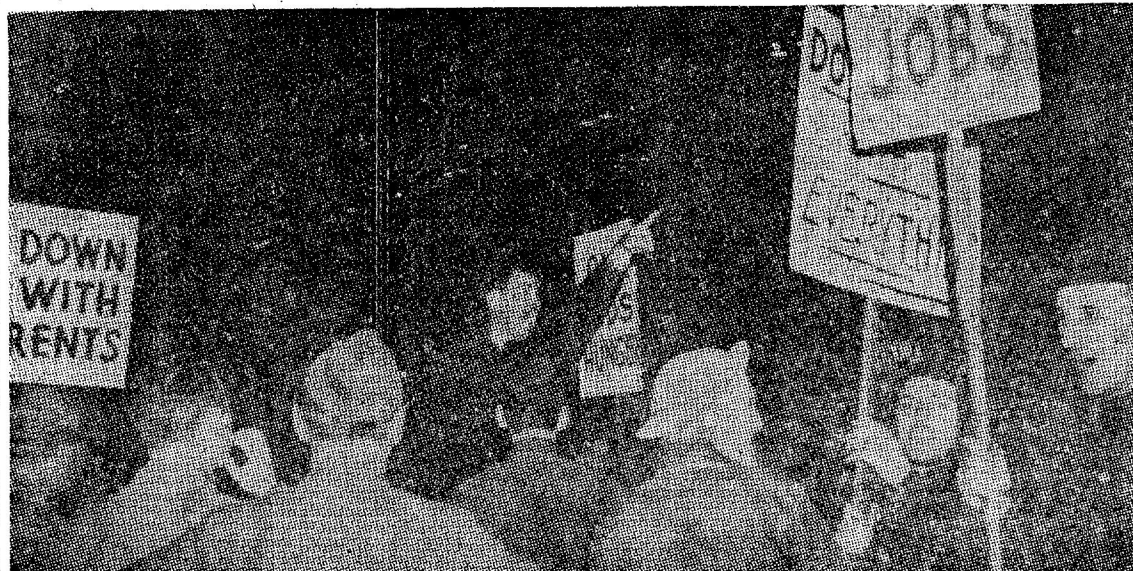
Last December the New York State Guard engaged in anti-labor drilling similar to the recent maneuvers in the Catskills. The photograph above, taken during the December drill, shows members of the Guard dressed as workers being harangued by an "agitator." Other guardsmen armed with two foot oak clubs dispersed the "agitators" who are carrying picket signs reading "Our Kids Are Hungry," "We Want Jobs," etc.