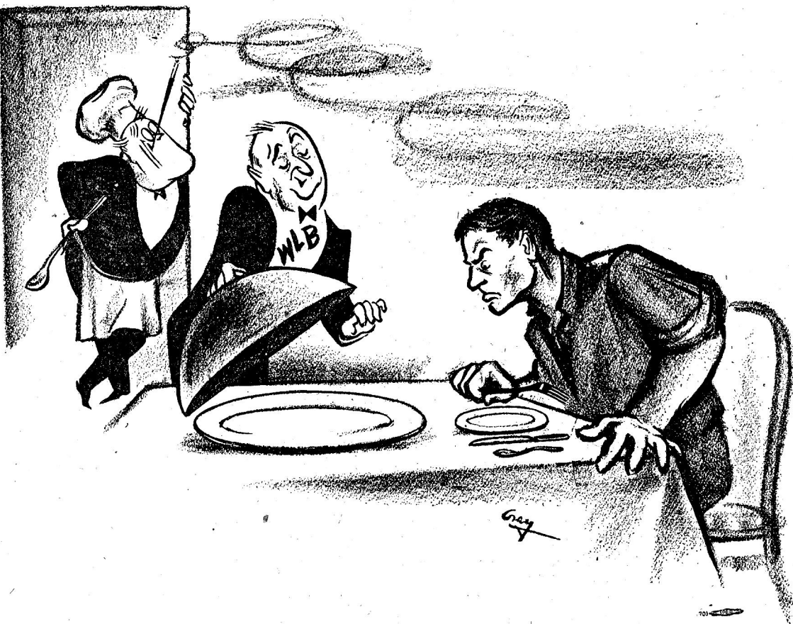
News Item: "After a year's study, the WLB declined to make any recommendation on union pleas to modify the Little Steel Formula."