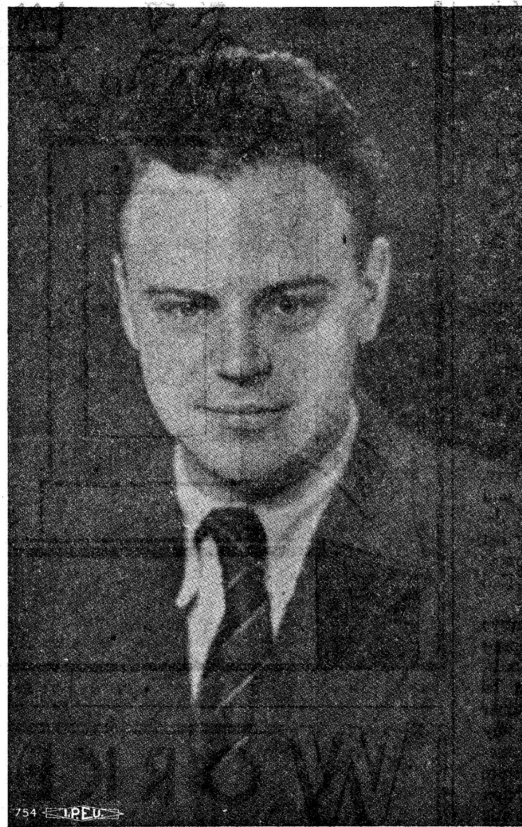
Leon Sedov, 1906-1938

Here Leon Sedov lived and worked. He did the research work, gathered material, made excerpts, sought out data for his father, who was deprived of freedom of motion by the strict incognito imposed by the conditions of exile. For the Old Man, Leon was a sort of alter ego, that part