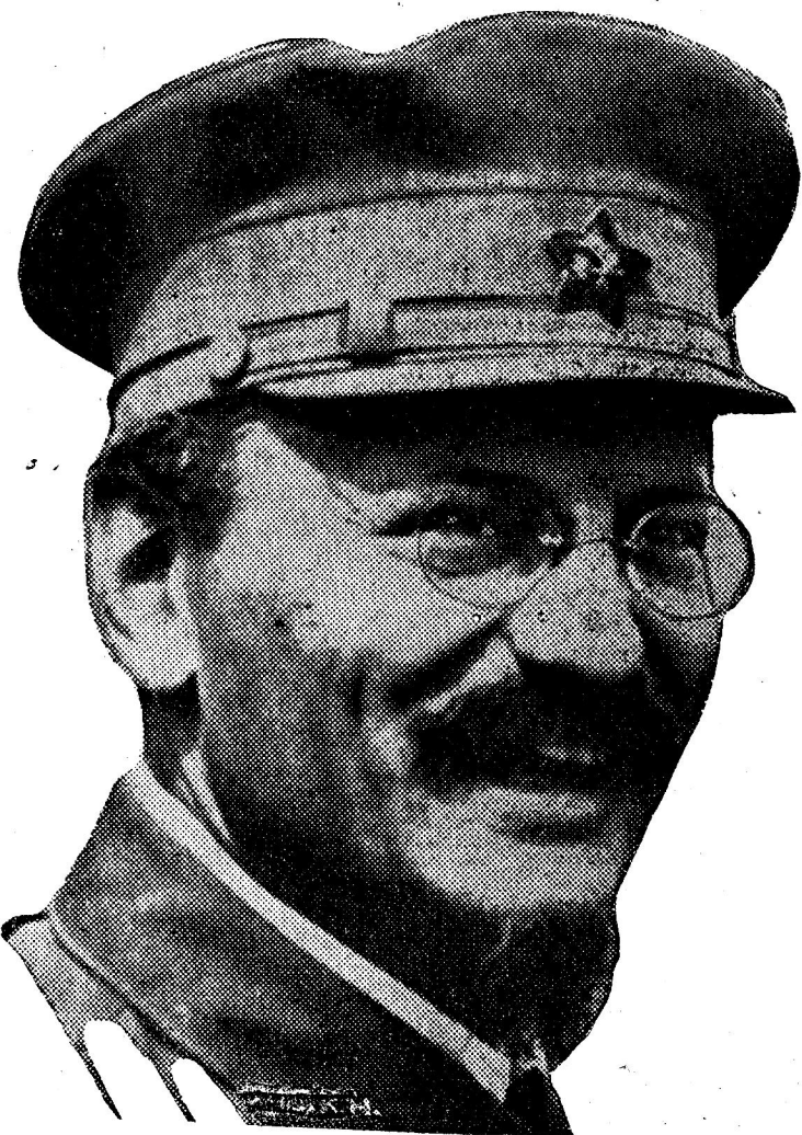
Leon Trotsky, Lenin's co-partner in the Bolshevik 1917 Revolution, was the organizer and leader of the Red Army when it saved the young Soviet Union. The Red Army celebrated its 26th Anniversary on Feb. 23. (See Editorial on Page 4.)

helped to frame, might have real meaning."