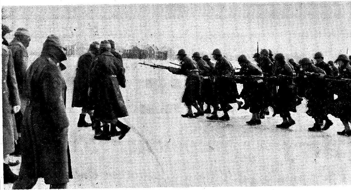
The above photograph was taken at a public strike-breaking exhibition staged at Ft. Snelling, Minnesota, on March 17, which had been advertised as a lesson in routing "foreign agents." The prospective victims of the fixed bayonets were other soldiers who posed as strikers bearing such placards as "We want 20 percent Raise in Pay, Shorter Hours," "Unfair to Labor. . . Strike," "More Pay, Less Work. . . Strike." Due to the protest of both AFL and CIO unions, photographs of these prospective victims became suddenly very scarce, and we were able to obtain only the photograph above, which was reproduced originally in the St. Paul Dispatch.