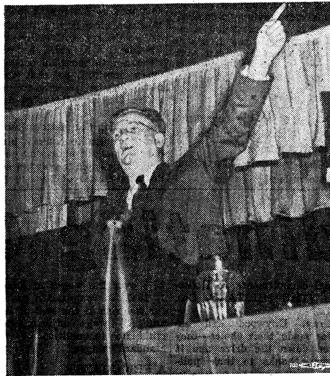
JAMES P. CANNON, NATIONAL SECRETARY, S. W. P.

Soviet system of planned economy over the capitalist system of private property and anarchy in production. This superiority of Soviet economy was first demonstrated, most dramatically and convincingly, in that very period, after 1929, of the world-wide crisis of the capitalist nations. When capitalist economy was plunging down to unheard of depths of stagnation and demoralization—in that very period, in spite of the backwardness of Russia, in spite of the isolation of Russia and its unworthy leadership, in that very period the Soviet revolution showed its power in a tremendous advance and development of industry.