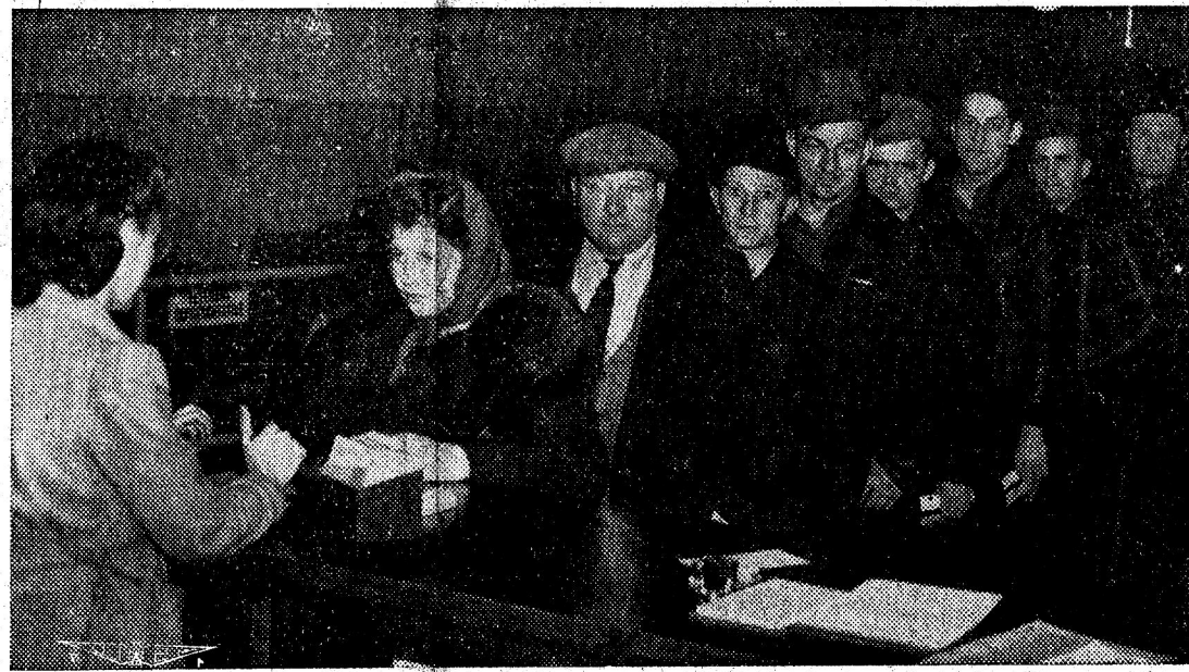
A typical scene in one of the many branch offices of the Michigan Unemployment Compensation Commission, besieged by auto workers laid off because of the lagging conversion of the auto industry to production of war equipment. Months will pass before they will be called back to the factories.