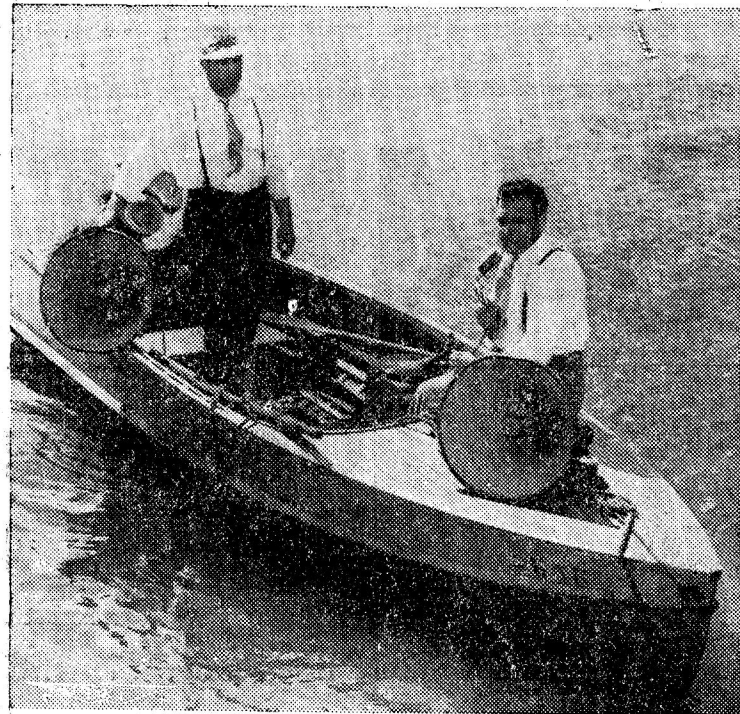
When these organizers of the United Automobile Workers (CIO) were refused sound truck permits for an NLRB pre-election campaign at the River Road Chevrolet and Axle plant, Tonawanda, N. Y., they ferried their loudspeakers out on the Niagara River in front of the plant and blasted away from offshore. The UAW won the election, 2,160 to 626.

for a slanderous attack on the UMW and Lewis by the Southern mine owners, through large advertisements, published in all the leading Eastern and Southern newspapers on May 21, entitled: "Listen America, Worse is Yet To Come."