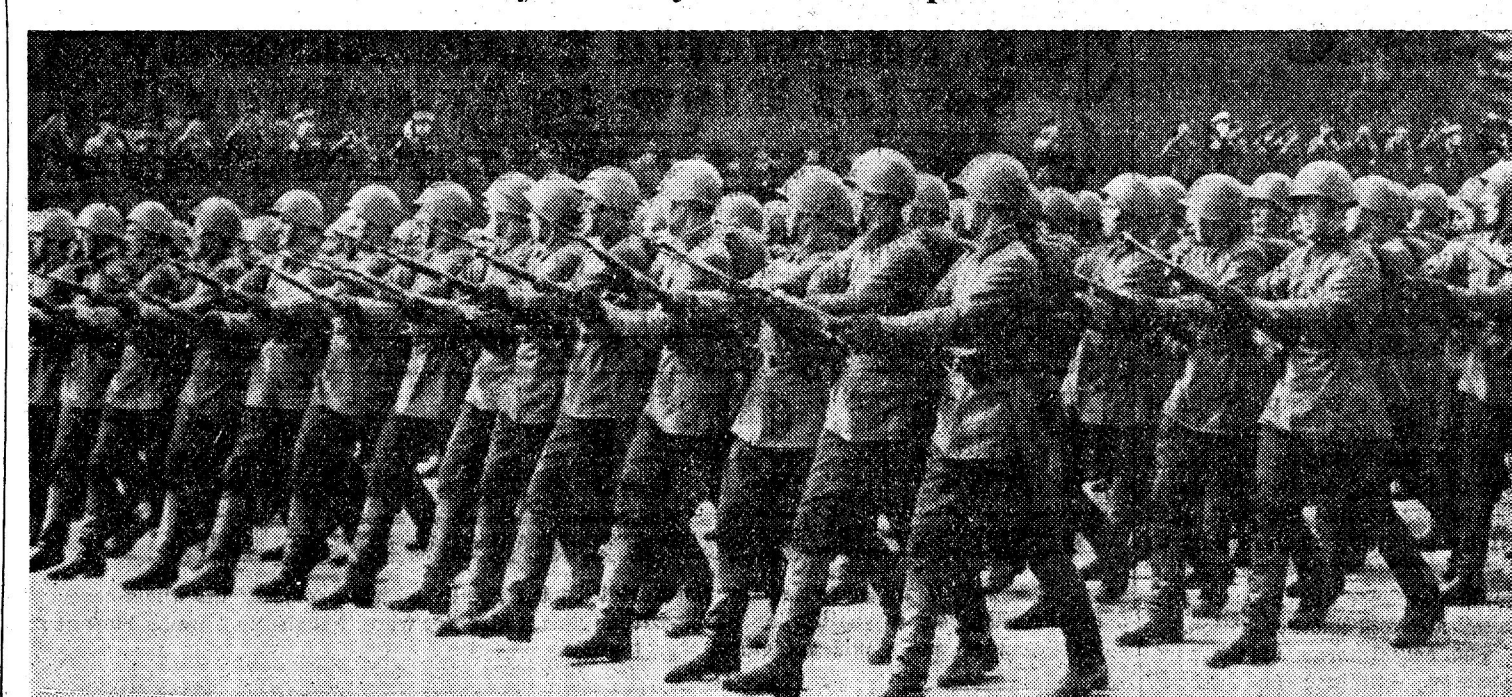
Red Army troops, with fixed bayonets, shown marching before Lenin's tomb in Moscow on May Day, 1940. Created by the October Revolution, the Red Army, led by Leon Trotsky, was victorious against imperialist invasion on 22 fronts.