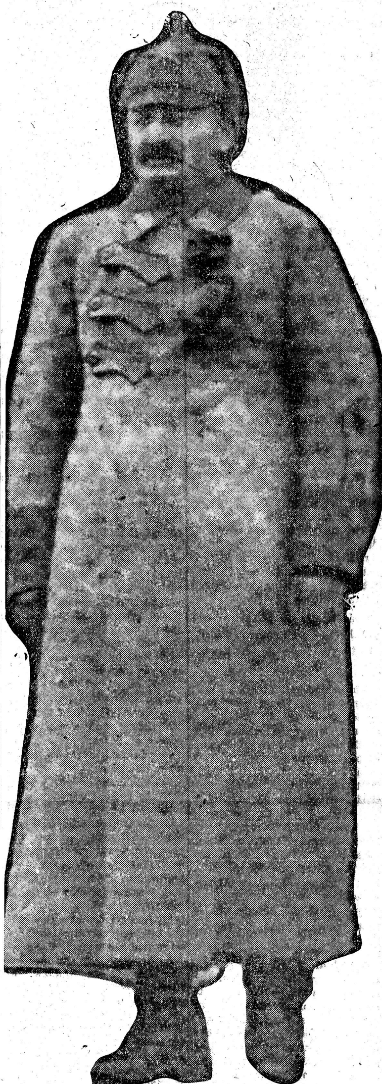
Trotsky, the warrior of the revolution, who twenty years ago created and led the Red Army that fought successfully on 20 fronts against the Whites and the armies of the Allied intervention. Only the same spirit that animated the Red Army of 1918-22 will win the battles of 1941.

propose to kill off millions of people to achieve the aims of Chamberlain, Churchill, Daladier and Bonnet." About Hitler's aims, Browder said not a word.