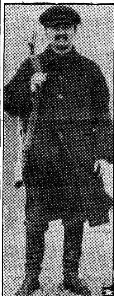
TROTSKY, WAR MINISTER 1923

To be sure, Britain, already engaged in a life and death struggle for its empire against the Nazi claimants to world power, is more