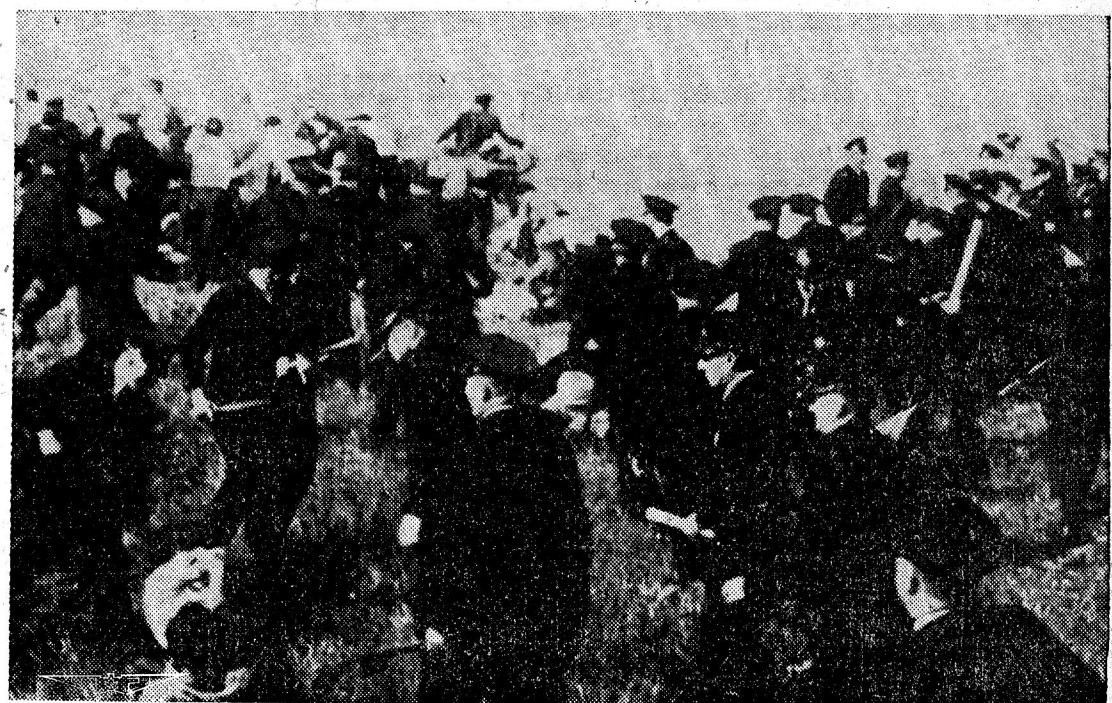
This is what happened four years ago on Memorial Day. On May 30, 1937, during the Little Steel Strike, hundreds of Chicago police fired point-blank into a peaceful column of several hundred strikers, their wives and children, who were marching to picket the plant of the Republic Steel Corporation. Ten unarmed strikers were slaughtered, shot in the back or clubbed to death. Old men, mothers, little kids were mercilessly beaten down with riot sticks and revolver butts. This was the way the Democratic Party machine of Chicago, Roosevelt's political henchmen, helped smash the Little Steel Strike. This year the magnificent strike victory at Bethlehem Steel and the rising tide of unionism throughout the rest of Little Steel have begun to pay back the bosses for the Memorial Day Massacre.