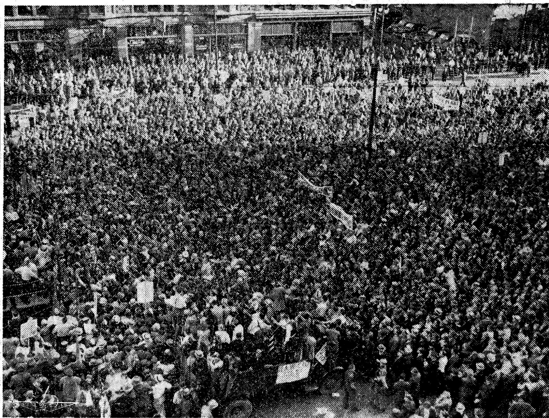
50,000 members of the United Automobile Workers (CIO) as they packed Cadillac Square in Detroit at the final CIO rally before the NLRB election at the Ford Motor Company. The Ford workers voted, on May 22, 70 per cent in favor of the CIO. This tremendous election victory breached the last anti-union barrier erected by Henry Ford, although this final success was virtually assured by the recent strike which successfully shut down the Ford River Rouge plant for the first time in 38 years.