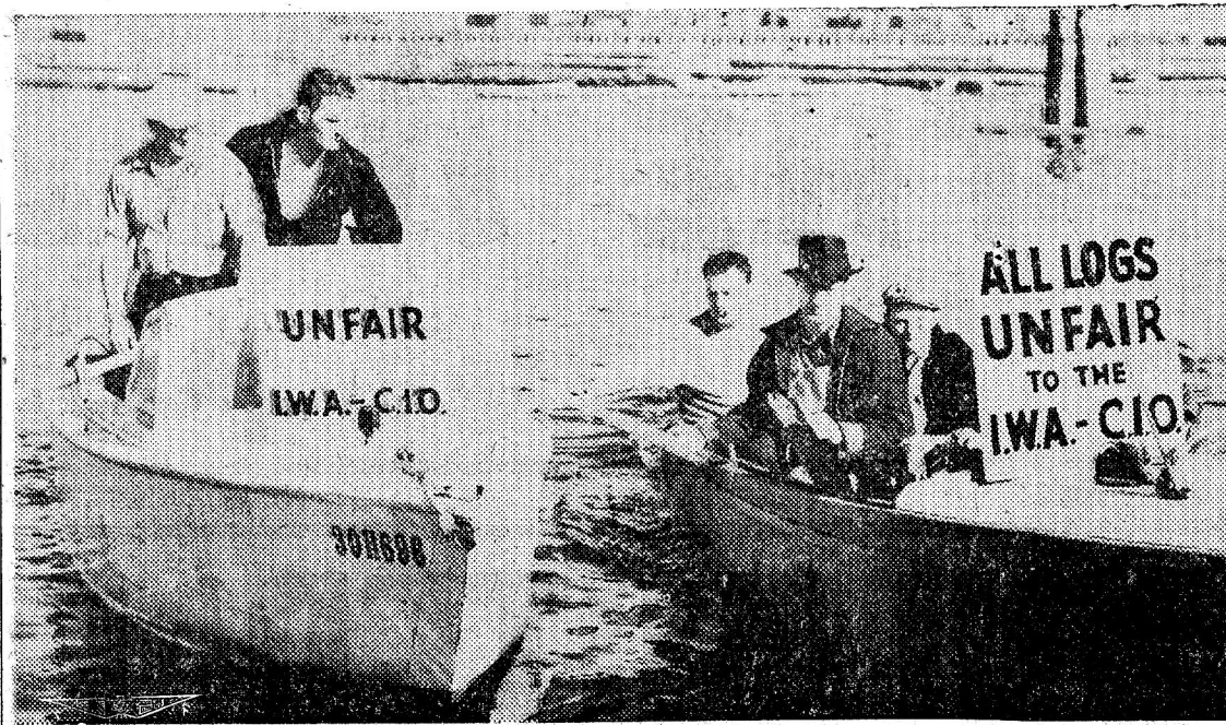
The picket line of the 22,000 members of the International Woodworkers (CIO) now on strike throughout the Northwest lumber area runs from the timber line right down to the breakwaters. Here strikers are picketing by boat.