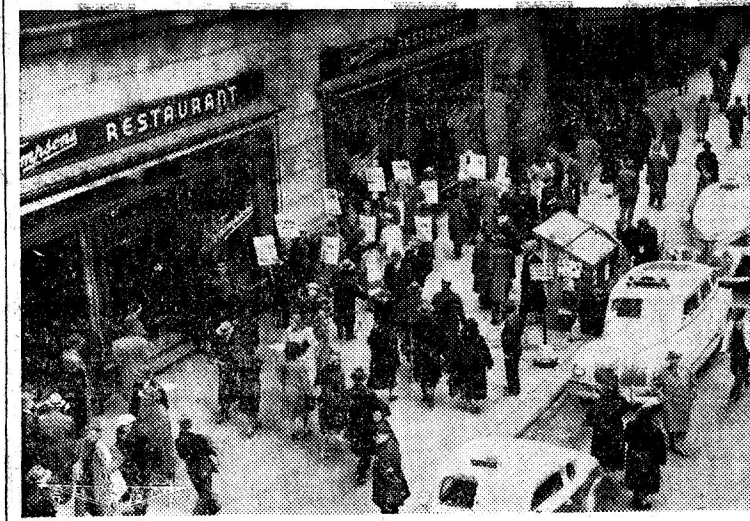
Workers of the J. R. Thompson cafeteria chain are shown picketing one of the strike-closed stores in New York. The 250 Thompson workers, members of the powerful Cafeteria Workers Local 302 of the Food Workers Union (AFL), have been conducting a militant strike for increased wages since March 17.