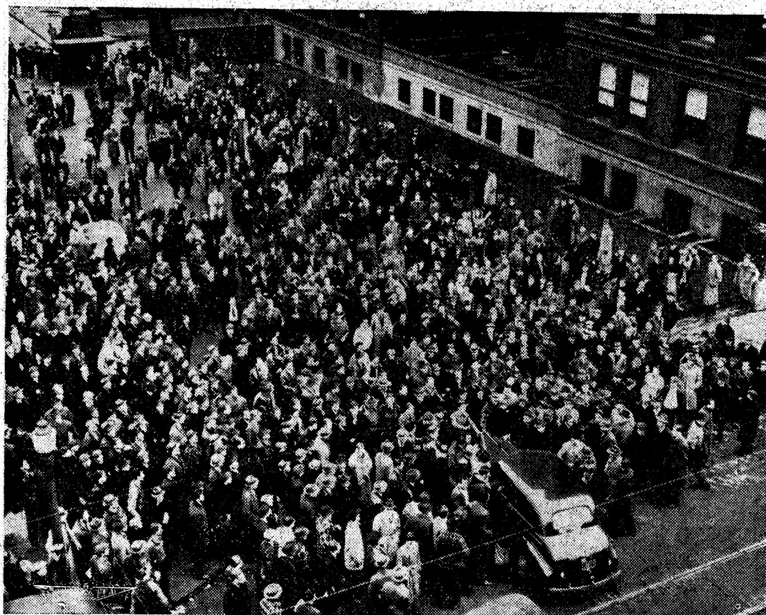
An unusual shot of one of the scenes during the victorious strike of the Steel Workers Organizing Committee (CIO) at the 21,000 man-plant of Bethlehem Steel in Bethlehem, Pa. A mass of strikers are shown here blocking the entrance to the main gate of the plant.