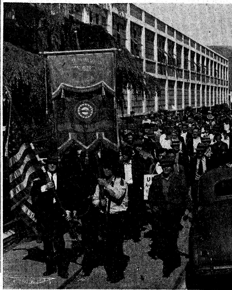
Mass picketing at the Oakland, California plant of General Motors where the United Automobile Workers Union (CIO) are striking against the provocative action of the company, which locked out 26 welders who had protested against the terrific speed-up.

They included many spectators, women with babies in their arms, children.