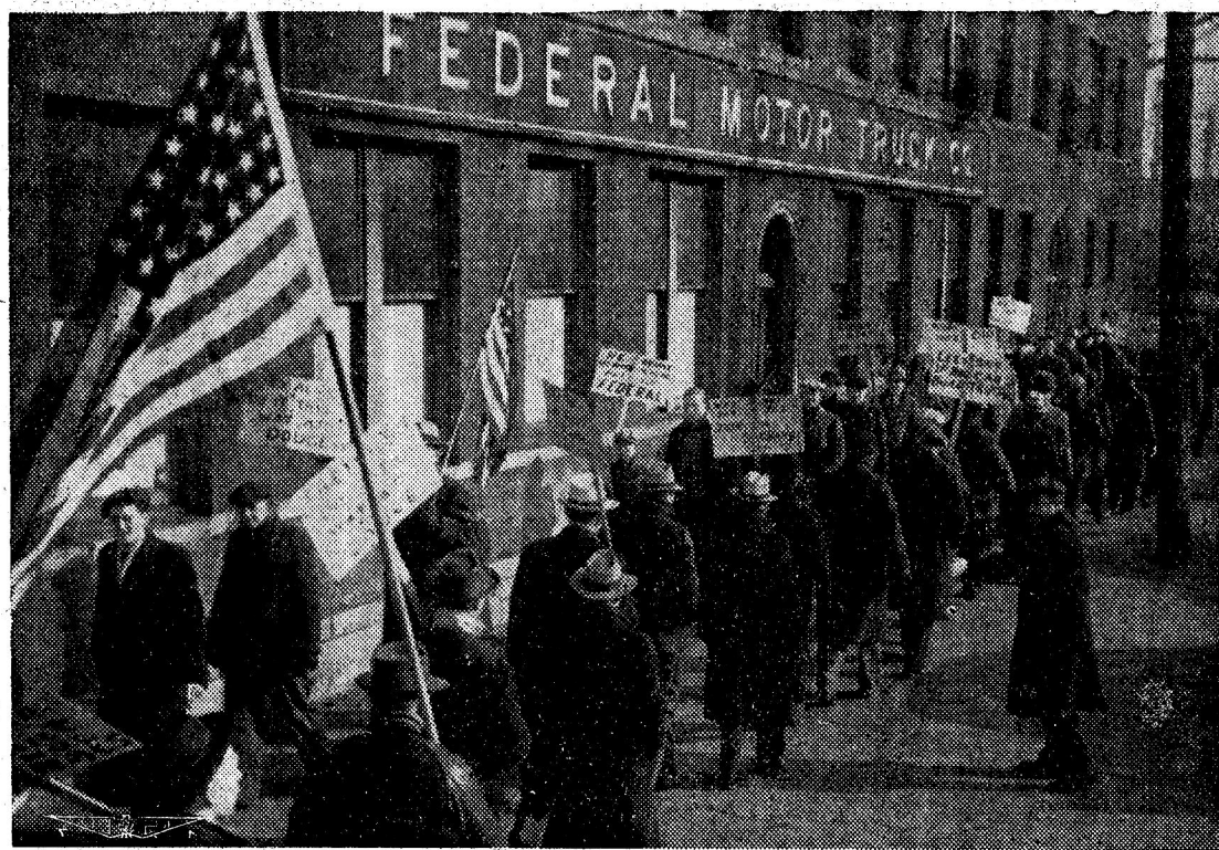
Members of the United Automobile Workers (CIO) picketing the struck plant of the Federal Motor Truck Co. last week in Detroit. The strikers are demanding wage increases and the union shop. The company holds $5,000,000 in war orders.