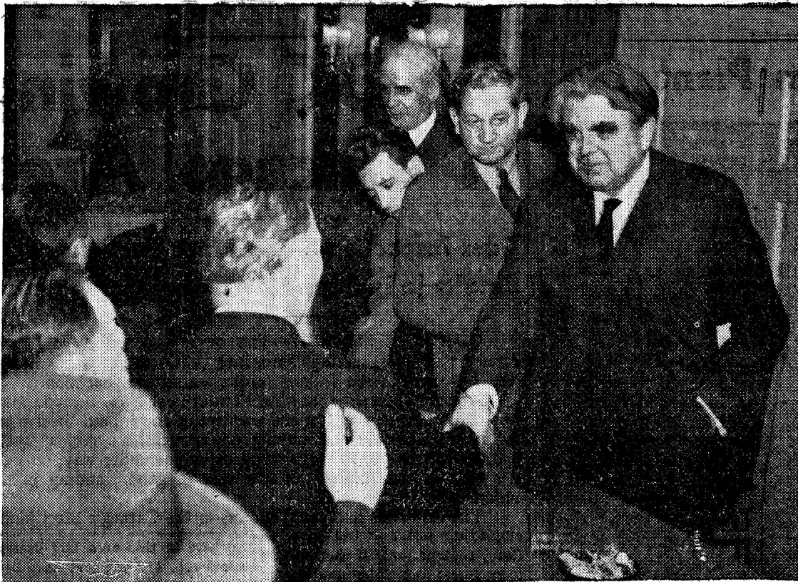
Delegates to the United Mine Workers Union (CIO) policy committee conference, in New York to negotiate wage increases for 450,000 bituminous miners, being greeted by UMW President John L. Lewis, and CIO head Phillip Murray (at extreme left).

Lewis assailed as "fantastic and absurd" the operators' figures on the cost to the coal industry of the $1 a day wage increase demanded. The miners' demands are "modest," said Lewis, pointing out that the miners' wages had increased only $1 a day in 24 years.