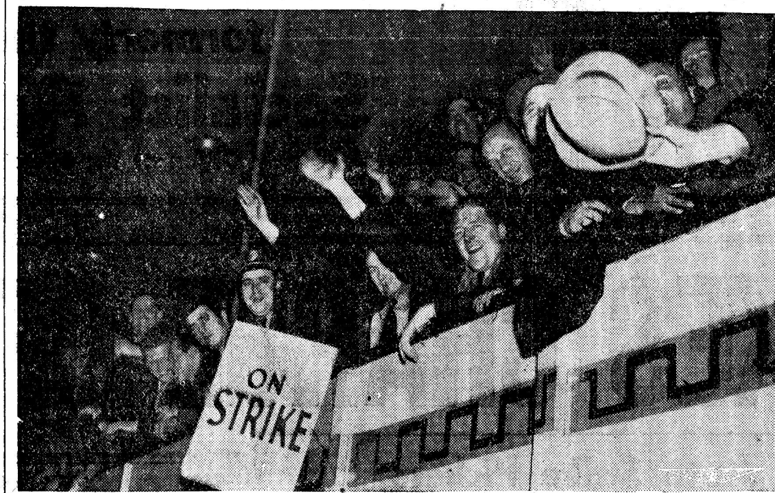
Showing the spirit that wins, members of the New York Transport Workers Union (CIO) cheer a speaker's call for fighting action at a rally of the 3500 striking bus drivers. The drivers have tied up 90 per cent of Manhattan's bus transport since March 10.