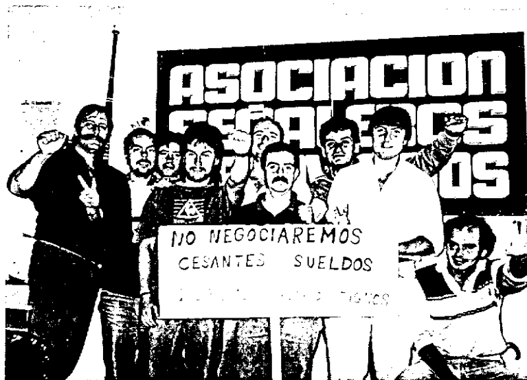
No negotiations. We want a living wage

SENALEROS ALEM 945, MORON 1708, BUENOS AIRES.