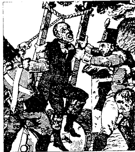
A continuous history of repression and injustice. British troops use a travelling gallows against rebels in 1798