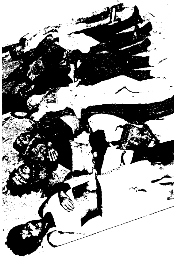
The result of a previous US "liberation" - in Panama

At the end of the war with all the imperialist propaganda seeking to get the working class and the middle class opponents of the war to heave a sigh of relief and turn away from the Middle East, it is important to hammer away at the conclusion that we have an international enemy and the international movement against it is our movement.