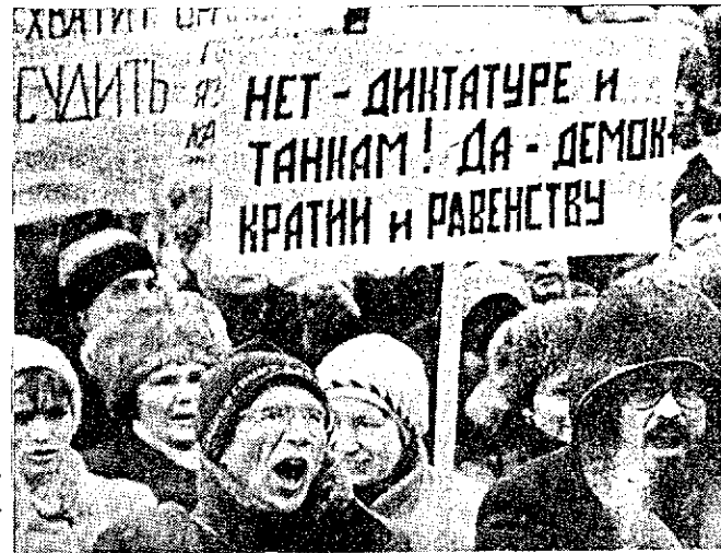
Protests in Moscow, January 16th. "No to dictatorship and no to the tanks. Yes to democracy and equality."

Yeltsin and the "radicals" want to move faster along the road of the free market which is already producing a deepening of hardships in Eastern Europe and Soviet Union. Their past woolly perspectives of mixed economy or "humane capitalism" are fading fast. Their cloudy "democratic" and demagogic phrases are growing more and more threadbare. That shows clearly in Poland, Czechoslovakia and other Eastern European countries. Yeltsin and his associates, themselves, have for some time talked about the need for strong measures. It has been the "radical reformists" such as Sobchak, the mayor of Leningrad, and an associate of Yeltsin, who called for a state of emergency. It was Sobchak who declared that; "Without a strong Executive Power, democracy could go into chaos."