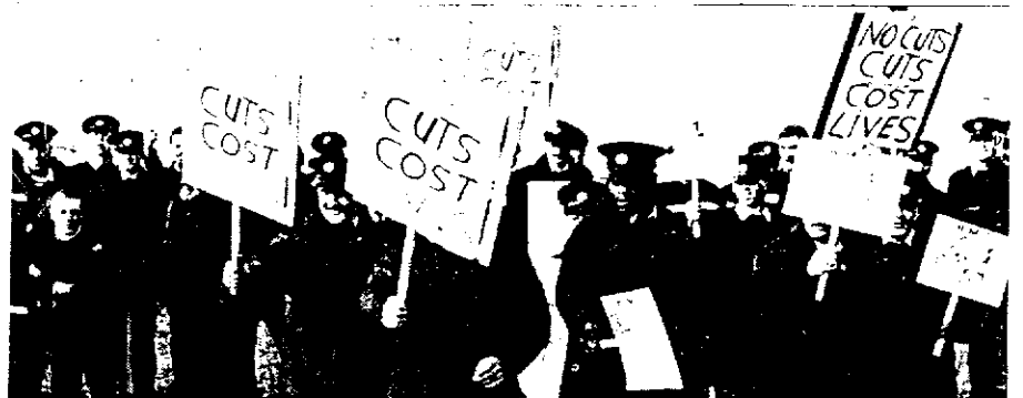
British firefighters facing similar cuts and closures

The various coalitions all plan to use the media by calling radio and TV talk shows, and by placing ads. The involvement of rank and file workers and the community will be critical.