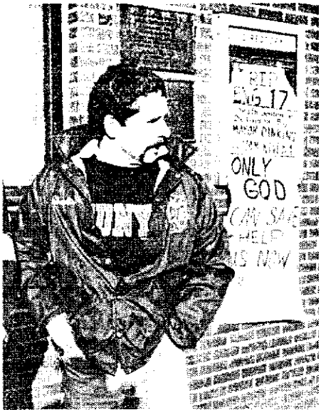
A fire station in Manhattan closed permanently on January 3rd, it had been open for 100 years

This article was re-produced from the March edition of Labor Notes. Address of Labor Notes: 7435 Michigan Avenue, Detroit, Michigan 48210. sive viewpoint. "