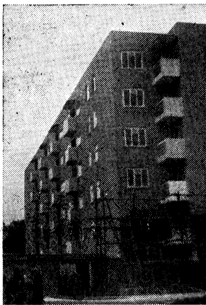
Working class flats under construction on the L.C.C.'s Lansbury Estate, Poplar.

A LETTER circulated to business-men by the Tory "London Municipal Society" (President Sir David Maxwell-Fyfe) tells how a victory for the Tories... "in this election will materially strengthen the hands of the Conservative Government in putting through the unpopular measures which are inescapable if the nation is to survive".