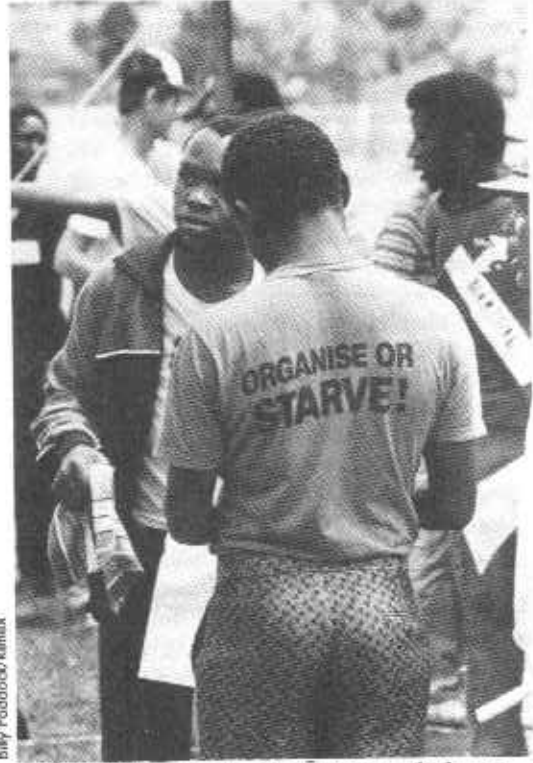
A COSATU organiser in Pietermaritzburg