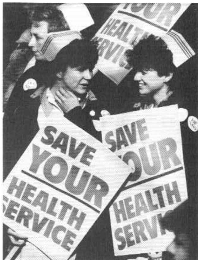
Nurses demonstrate on 5 March 1988

Cutting the Lifeline , focuses and highlights the important issues to be addressed by those campaigning for the NHS — and brings together some of the