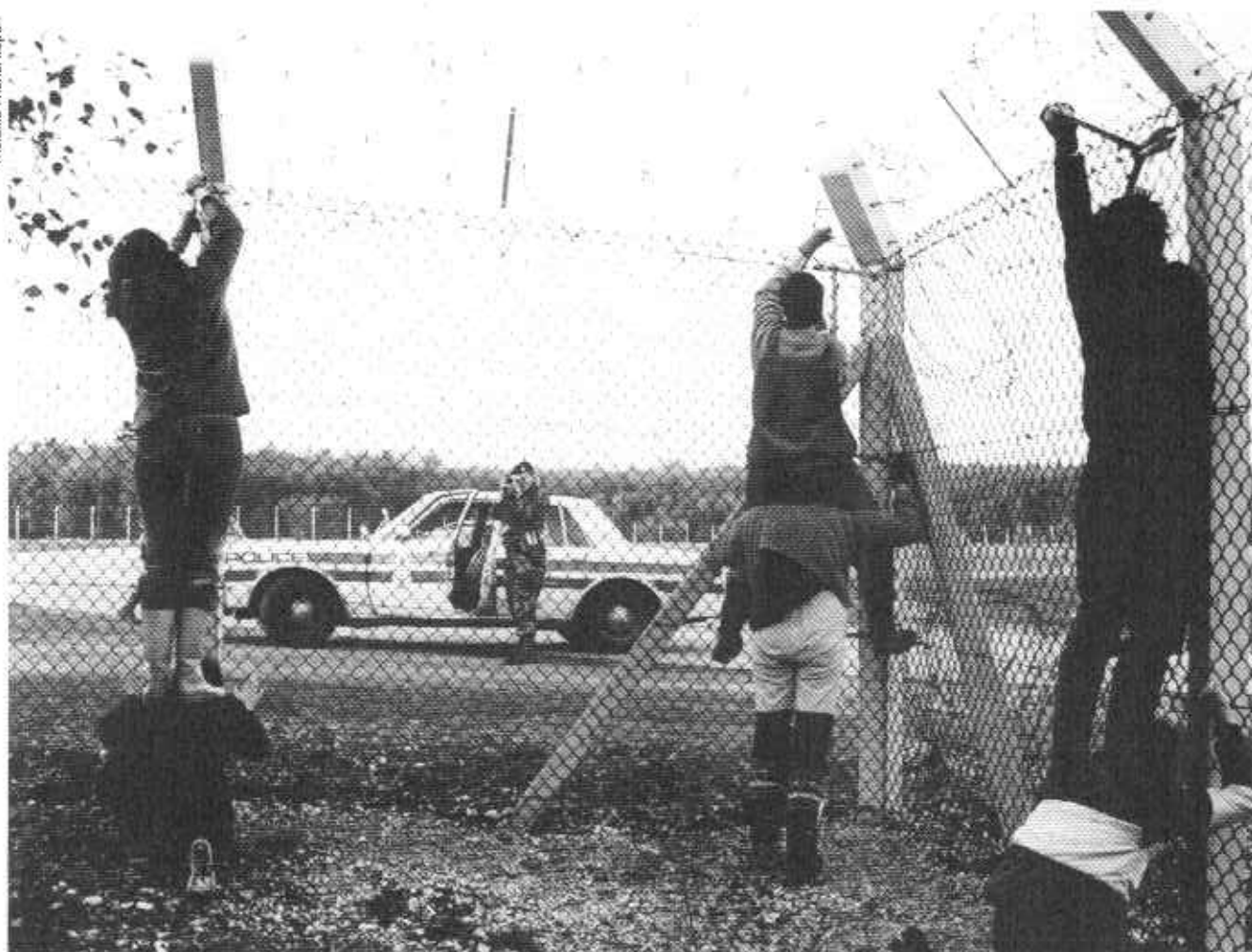
Women cutting the fence at Greenham