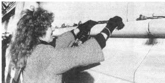
A campaigner lays a carnation outside St. Thomas hospital at a FAB rally before the second reading of Alton's bill

The victory conference of FAB took up a number of proposals around an offensive on the issue of 24 weeks. One of the most important was to put together a pro-choice charter which can be used to campaign for a woman's right to choose and to fight against the concessions that the new realists in the labour movement seem willing to make on our behalf ●