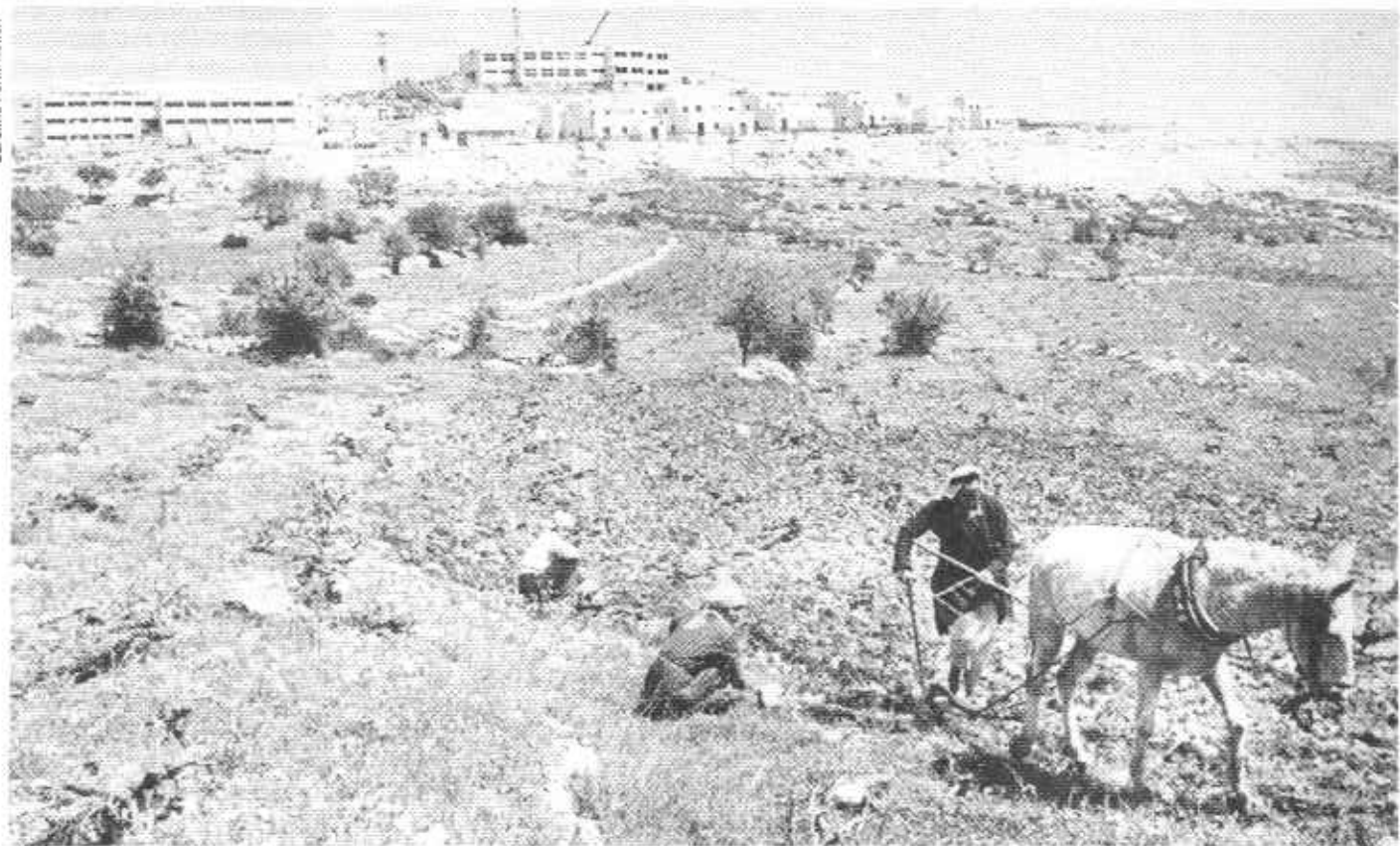
Palestinians work the land beneath Grata settlement, West Bank: now the Zionists plan to destroy their crops

After seven months of widespread rebellion, the united leadership of the Palestinian uprising continues to develop increasingly sophisticated means of struggle. JACK GOLDBERG reports.