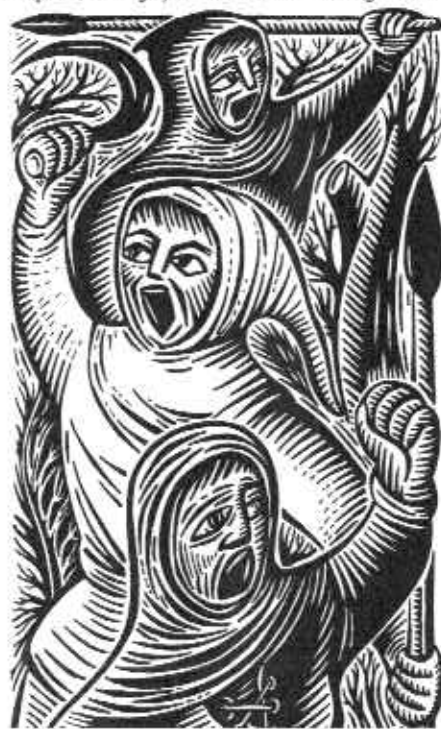
The peasants' revolt of 1381: the year of the last attempt to levy a poll tax

If peasant bondage began in the Roman empire, it enjoyed a late flowering in the