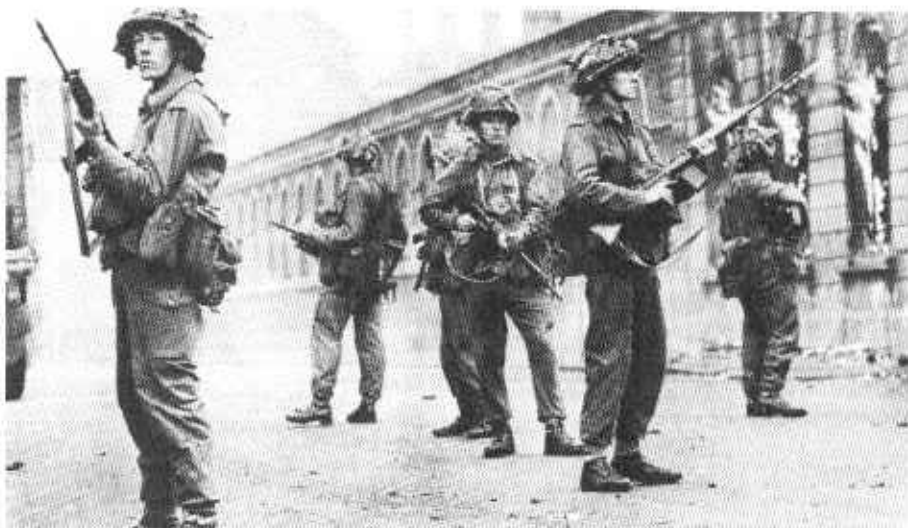
1969: British troops go into the north of Ireland

Influences on the young people who formed Peoples Democracy were much broader. The Vietnam solidarity movement helped us to develop an anti-imperialist consciousness and solidarity