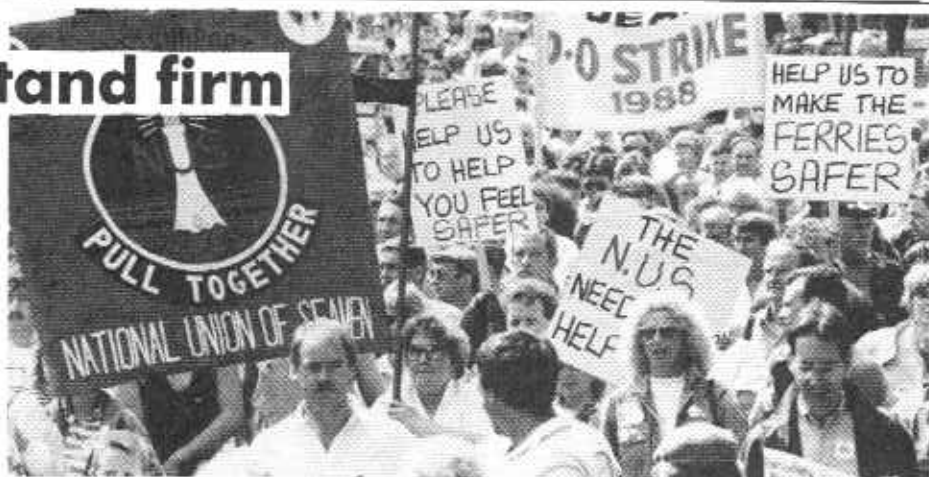
Thousands demonstrate in support of the P&O strikers, May 1988

The rank and file are not bothered about the funds being sequestrated — we know the union is its membership, not just its funds. The funds could be built up again once the