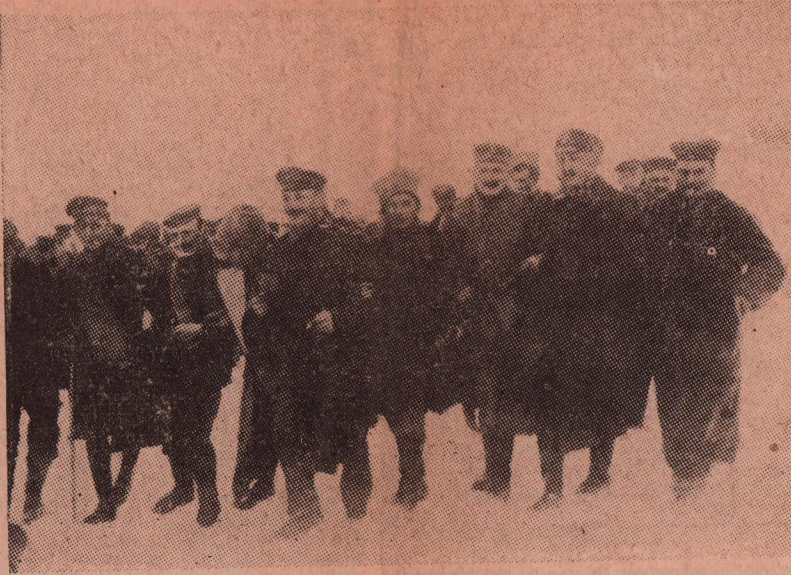
German and Russian soldiers fraternising on the Eastern Front in the last war.