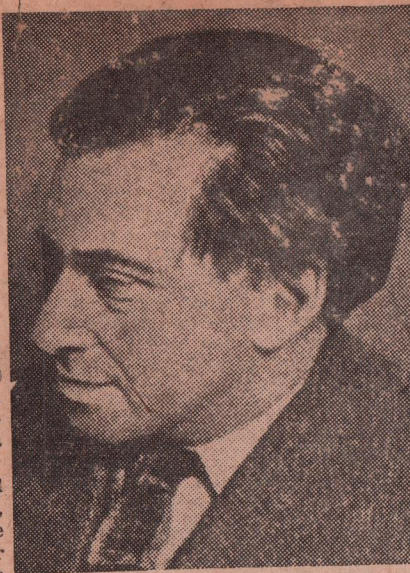
ILYA EHRENBURG — EX WHITE GUARD NOW ROUBLE MILLIONAIRE

As for German women, they evoke in us only one feeling—of disgust. We despise them because they are the mothers, wives and sisters of hangmen. We despise them because they wrote to their sons, husbands, brothers: "Do send us a pretty fur coat!" We despise