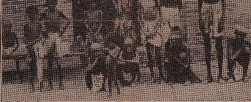
Famine is a dread horror which strikes parts of Africa, China and India. The progress of science has rendered this affliction entirely needless with modern methods of food production. The picture above gives a vivid idea of the results in stark horror and indescribable suffering which famine inflicts on its victims.

They too have pretended that this decision is the personal responsibility of Morrison. They have deliberately set out to conceal the responsibility of the Government and of the Cabinet. Far from using this episode to show the class character of the Government and the reason for its partiality towards fascists, they have systematically disseminated the policy of appealing from the Devil towards Satan, from Morrison to the Cabinet, from the Cabinet to the Tory dominated parliament. A campaign of paper petitions and demonstrations, carefully indicating in advance that even these mild measures were not to be construed as actions against the Government, i.e., against those fully responsible for the decision. In leader articles in the "Daily Worker" they have asked for contemptuous slaps in the face. The Cabinet must act, parliament must act, etc. "Parliament can yet save the country from the shame of this release. It can compel the Government to put Mosley back and thus heal the grave breach in the unity of the nation." ("Daily Worker" 1.12.43.) And so on in this cringing cur-like strain.