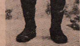
A MALAYAN WORKER CAPTURED BY THE BRITISH. Note the uniform of the former Malayan People's Anti-Japanese Army.

from where they issued to Malaya. They were commanded by British officers.