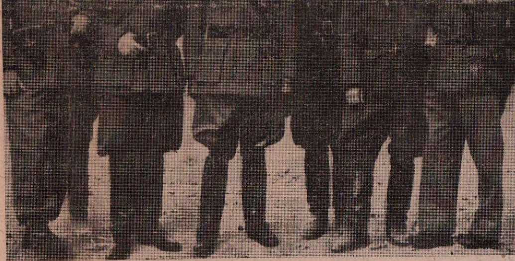
Tito with his Chiefs of Staff who became Members of the Political Bureau after the war. The two crosses mark Zujovic and Hebrang arrested by Tito as "Spies and Traitors."