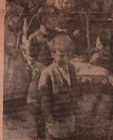
Orphaned German Children

In their recent struggles these workers have demonstrated a spirit which should constitute a warning to the bosses that they are in no mood to be trifled with, and, given a firm and determined leadership which has learnt the lessons of the defects of their previous struggles, should make important inroads into the miserable nature of their present conditions.