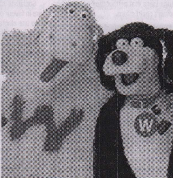
Right now, cuddling up to the bosses is the last thing on the minds of Woolies' staff

In this recession some of the biggest announced closures and layoffs are in the service industry comprised of retail and hospitality where more women than men work. As the retail sector is female-dominated, the recession will have