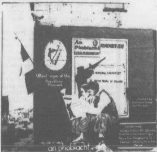
THE FOOD OF THE REVOLUTION

So start gathering them now. Not only purely political stuff, anything that is a decent read. Historical fiction and novels etc. Show your solidarity and support for the revolutionary freedom fighters of Ireland, and know that in a small way, you are contributing to the strengthening of the revolutionary movement in this corner of the world. Send them to us as soon as possible or if the postage is too expensive, get in touch with us and we will arrange to have them collected. Get cracking now.