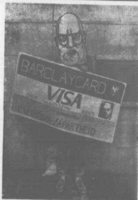
BARCLAYS BANK ONE OF SOUTH AFRICA'S BIGGEST INVESTORS

In fact the sanctions that are being asked for are very limited ones and would not have a massive effect on the S.African economy, but the British government is still unwilling to apply them. The reason is not very difficult to find. Britain has +11 billion pounds invested in S.Africa and annual exports there total +1.2 billion. There are 250,000 jobs riding on these investments, and there are 300,000 potential immigrants, entitled to enter Britain if the regime there is toppled. It is this which makes Thatcher so desperate to overstate any reforms in S.Africa, and to join in with Botha in calling for the preservation of law and order. Because the British government too, are terrified of the forces by which Apartheid is being made to crack.