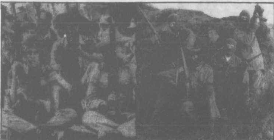
● In the Newspeak of the establishment press, Salvadorean FMLN militants (left) are described as guerrillas or rebels whilst IRA Volunteers (right) are described as terrorists; in reality, they and their causes are one and the same — freedom fighters for national liberation and socialism