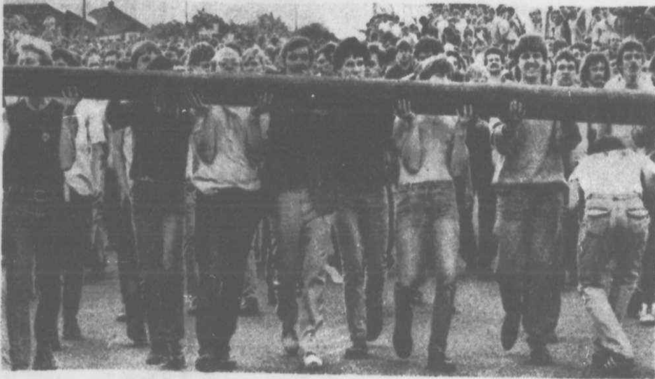
THE MINERS SHOW US ALL THE WAY FOWARD. MAKE SURE THAT YOU DO ...

The miners' strike drags on into its fifth month. Every passing day brings then nearer to the time when victory becomes a real possibility. Nearer to the day when the massive stocks of coal reserves built up since the introduction of productivity deals (see article inside) begin to run out. Nearer to the longer chilly evenings of Autumn when the demand for those depleted stocks will begin to rise and rise. If the miners can stick it out until then, and so far there is every indication that they can, then they can win this strike, make no mistake about that. Such a victory would probably be the most far reaching working class victory of this century.