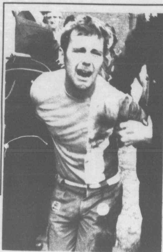
A MINERS MISERY INFLICTED BY POLICE-CAUSED BY SCABS

happens they will come out fighting with the rest of us. Bullshit, even though they are happy enough with the benefits being in a union gives them they're not prepared to fight to make unions strong. For instance in the 1920s after the general strike, scab miners in Nottingham, with the help of a Labour MP Edward Spencer, set up their own union. This contradictory effort was doomed to failure simply because the most 'militant' supporter of a scab union is likely to be the biggest scab himself (as useful as a bunch of Atheists setting up their own church). After some lessons on realism from management after about 10 years, they drifted back to the NUM.