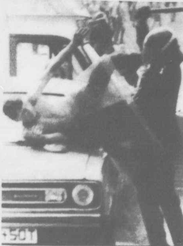
above: PICTURES FLEET ST. DONT PRINT

The articles in Red Action are written by individual members, friends and contacts. They are the sole responsibility of the author or authors and while we would obviously not print anything that was obviously anti-socialist we would not refuse an article just because we didn't agree with every part of it. The views expressed are those of the writer, and it should not be assumed that they are the views of every Red Action member.