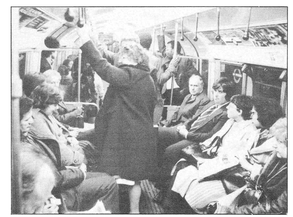
Drivers alone may soon be responsible for passenger safety.

THE introduction of oneman operation on London Transport trains is once again to the fore.