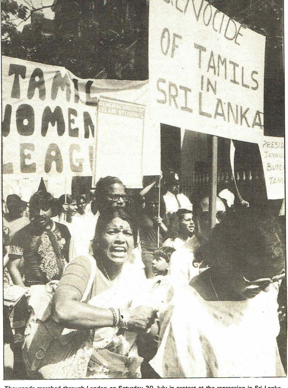
Thousands marched through London on Saturday 30 July in protest at the repression in Sri Lanka.