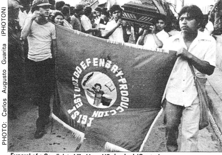
Funeral of a Sandinista killed by a US- backed 'Contra'.

That is why the argument of certain sectarians in America is so pitiful. They capitulate completely to the arguments of the Sandinistas that the government in Nicaragua is the "democratic dictatorship of the proletariat and peasantry", a hybrid that never existed in history CONTINUED ON PAGE EIGHT