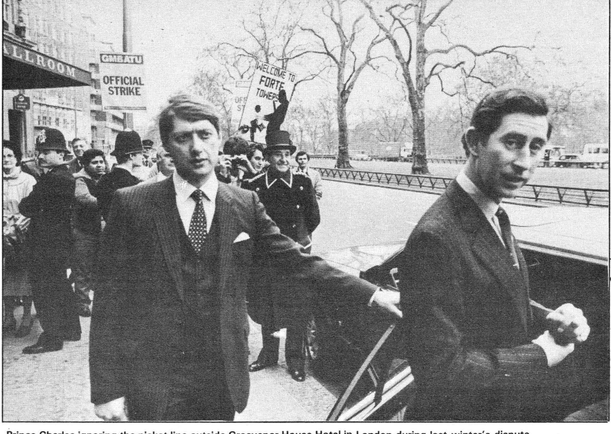
Prince Charles ignoring the picket line outside Grosvenor House Hotel in London during last winter's dispute.

Yours fraternally Terry Fields MP, Liverpool, Broadgreen.