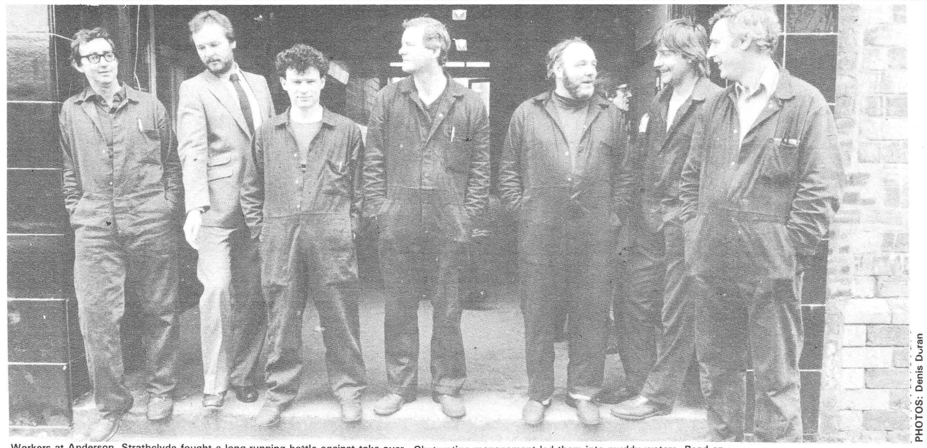
Workers at Anderson, Strathclyde fought a long-running battle against take-over. Obstructing management led them into muddy waters. Read on.

ANDERSON STRATHCLYDE is a mining equipment manufacturer employing some four and a half thousand people in Britain.