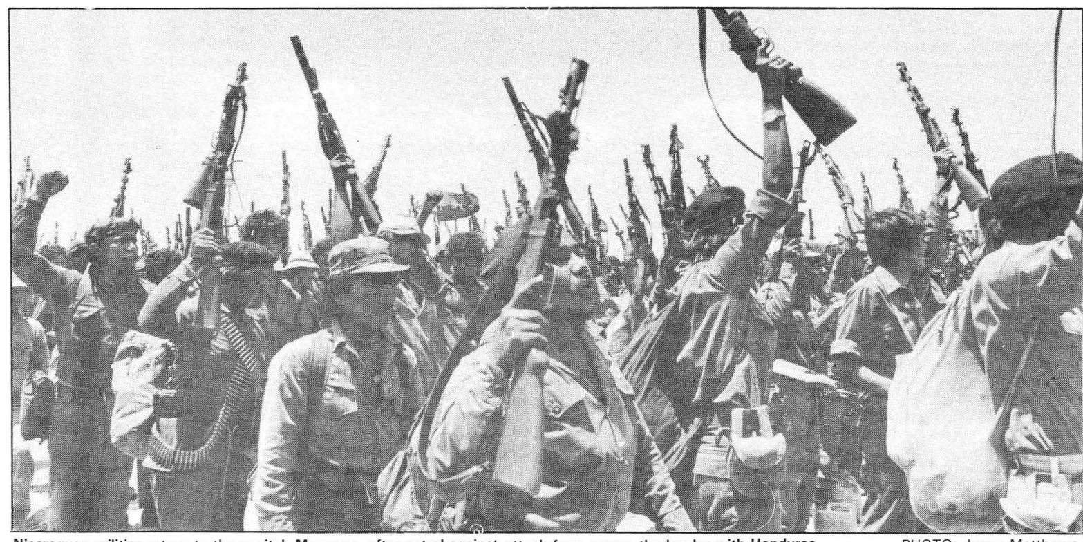
Nicaraguan militias return to the capital, Managua, after patrol against attack from across the border with Honduras