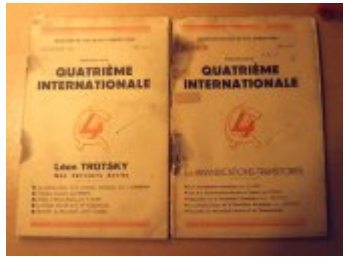
Earlier issues of Quatrième Internationale, a predecessor of International Viewpoint

The Fourth International was founded when it was "midnight in the century". Fascism was on the rampage, the counter-revolution had triumphed in the USSR and Stalinism was suffocating the revolutionary workers' movement all over the world. In contrast with the preceding Internationals, it was not carried forward by waves of workers' struggles and a growth of the working-class movement.