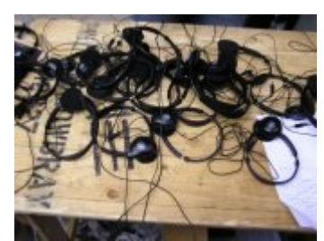
Translation headsets used at European Social Forum

Even though the level of participation in the European Social Forum in Malmö (Sweden) was limited, this framework remains irreplaceable in order to permit a sharing of experiences and to support the organization of mobilizations on a European scale.