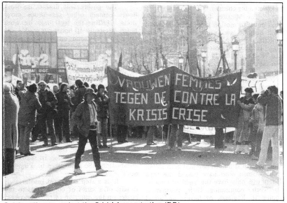
Belgian 'Women against the Crisis' demonstration

points of the women's struggle in Belgium. Two days before the March 6 demonstration this year the daily newspaper De Morgen quoted the spokeswoman of the FGTB women's commission as saying: 'We have everything to gain from collaboration between the FGTB and the socialist feminist groups.'