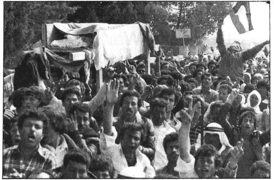
Thousands protest in Tel Aviv

These actions were followed by the placing of several towns and refugee camps under a state of siege; the arrest of hundreds of persons charged with involvement in demonstrations, some of whom have been sentenced to heavy fines or jail terms; and the murder of several dozens of people, either in demonstrations, or in circumstances that as yet have not been clarified.