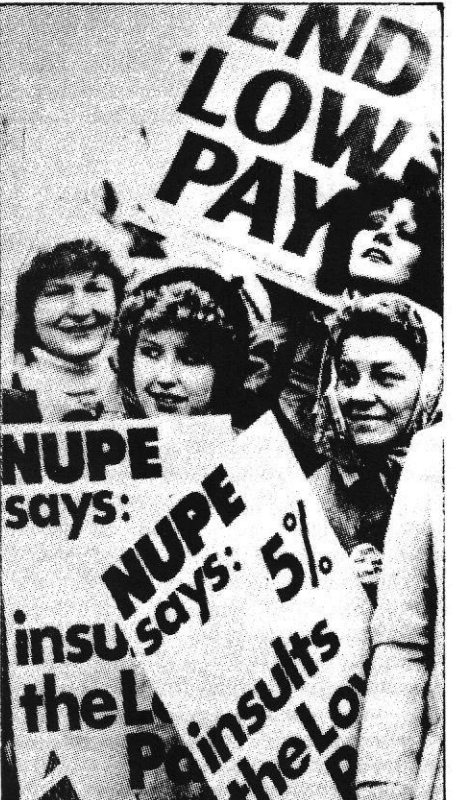
Women workers in Britain (DR)

It is widely recognised in the labour movement that the Equal Pay and Sex Discrimination Acts have failed. Why? Job segregation and women's role as a reserve army of cheap labour are the main