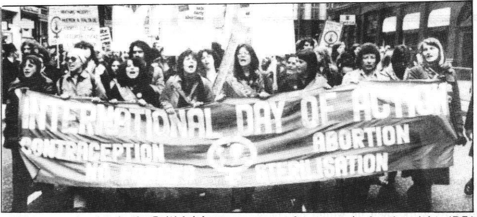
Wide support exists in the British labour movement for women's abortion rights (DR)

The principle behind the Sex Discrimination and Equal Pay Acts was the notion of providing equal opportunity. That is, removing barriers which prevent women going into certain jobs or getting decent pay. Now the labour movement is talking about 'positive action', or affirmative action as it is known in the USA. This is seen as the next step towards women's equality.