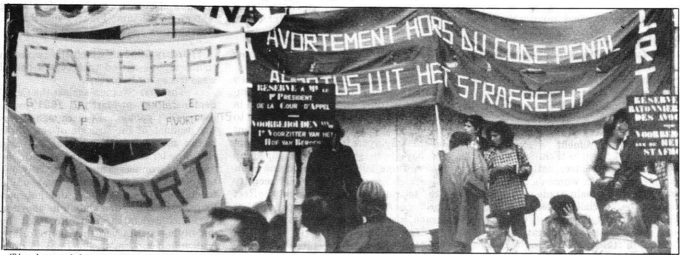
The demand for abortion remains a major debate in Belgium

The trade-union bureaucracy, with the limited actions that they organise, do not offer even the shadow of a perspec-