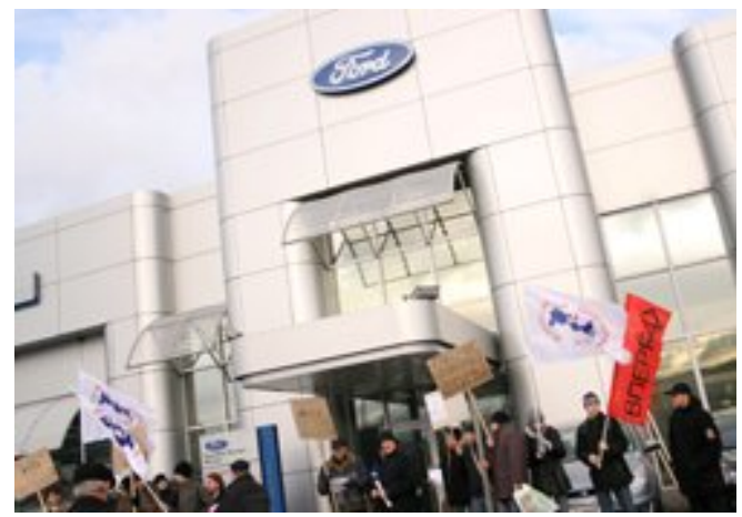
Workers demand a 35% pay rise Renault workers supported the strike at Ford

It was following the first strike of the "Fordists" (concluded by the signature from a collective agreement), last February, that the strike movement started to develop in the country. Since then, we have learned of dozens of cases of strikes. Most of the time, because of the regressive labour legislation and repression by employers, they ended in sackings, disciplinary actions and condemnations for "illegal strikes".