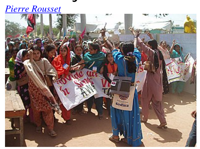
The struggle continues against the martial law regime in Pakistan and it deserves our solidarity.

Dear friends, Various solidarity initiatives have been taken. From ESSF, here are three links: