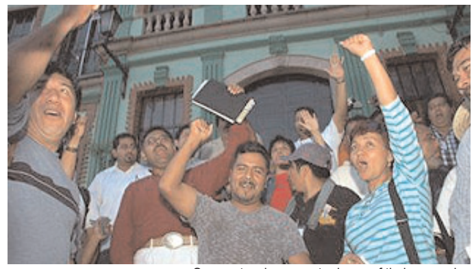
Oaxaca teachers greet release of their comrades

These actions, directly organised by the national intelligence committee chaired by President Vicente Fox, are widely seen as trying to create a 'strategy of tension' - a climate of fear aimed at discrediting the