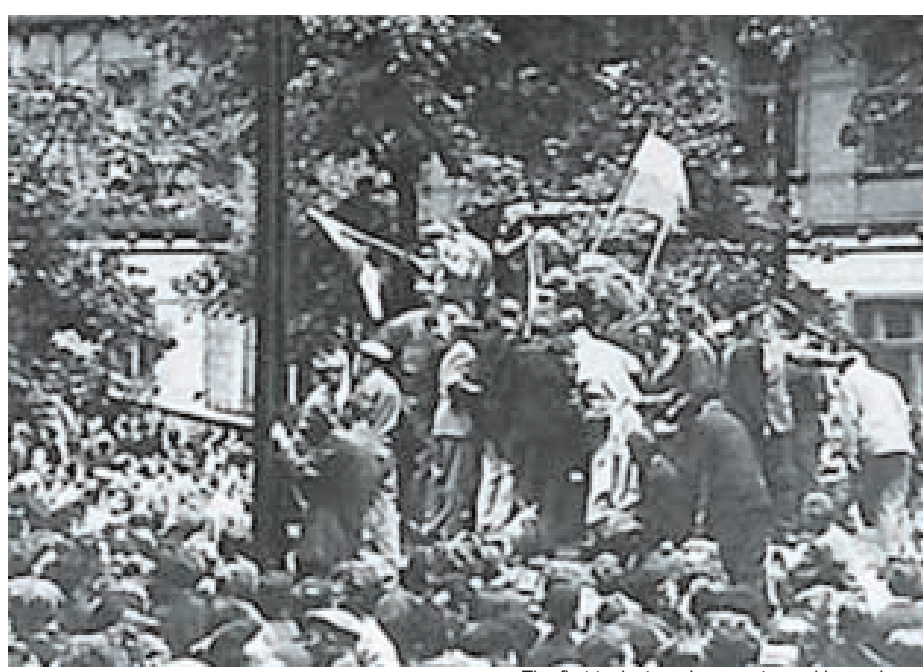
The first tanks to arrive are stopped by workers

From 4pm onwards the town was besieged, bit by bit, by a force of two armoured divisions and two divisions of infantry - a force totalling 10,000 soldiers and 360 tanks, under the command of the deputy minister of