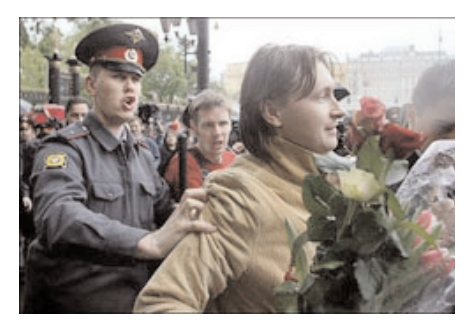
Moscow - a "21st century Stonewall

defence team is attempting to argue there was no intention to murder and to have the charges reduced from murder to manslaughter.