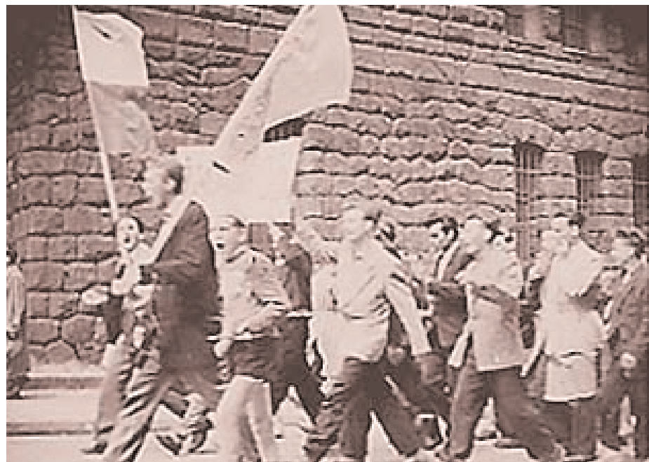
June 24 1956. Workers march out of factories