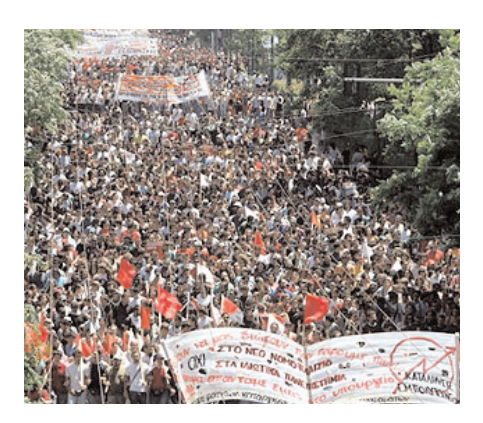
mobilizations. They have no bureaucratic leadership to overcome!

There is no bureaucratic student structure to present itself as the official interlocutor with the government. Only the decisions of the assemblies legitimize any form of mobilization