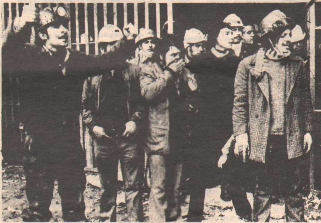
Striking workers in Santiago, the Chilean capital

And what of the interests of large capital. The drastic measures, the junta has undertaken are a