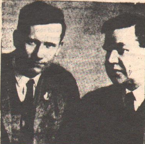
1922: James P. Cannon (left) and William ('Big Bill') Haywood (right).

During the second World War Cannon was imprisoned for his opposition to the intra-imperialist war. His letters from prison provide a vivid guide to a Marxist education.