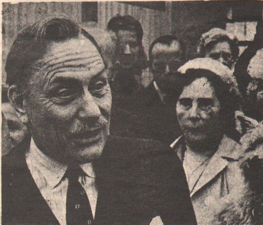
Mr. Enoch Powell arriving at Aldergrove Airport, Belfast.

And such a unified base would take Powell from the fringes of British politics back into the centre block of Ulster MP's in the presently disorganised state of parliamentary politics which would make Powell an important factor. This would be further increased if representation of the Six Counties is expanded to 20 MP's instead of the present 12. Powell is also attracting support from the right wing of the Conservative Party, from the 70 or so Tory MP's in the Ulster Group, and even from people inside the shadow cabinet.