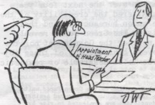
"Just one more question - can you run a school without money?"

Also in the area of civil rights, student unions must intensify their activities for the legalisation and free dispensing (through the Health Boards) of contraception, and urgently demand equal administration of social assistance to all school-leavers, whether male or female.